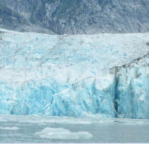
on to Endicott Arm brings you up close to Dawes Glacier, wildlife.