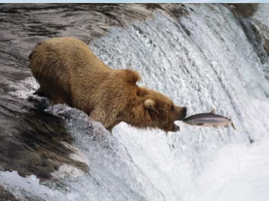
Look for brown bears fishing in the protected Inside Passage waterways.

Your small ship allows you to look for humpback whales feeding in the nutrient-rich waters surrounding Point Adolphus. Cruise through Icy Strait to the wild Inian Islands,