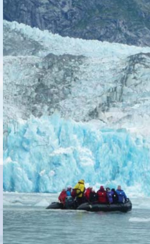
A naturalist-led Zodiac expedition home to many species of unique