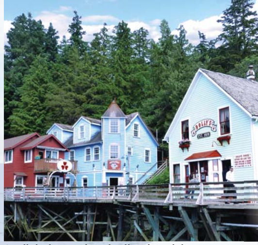
Stroll the historic boardwalks of Ketchikan's Creek Street, famed for its colourful frame houses.