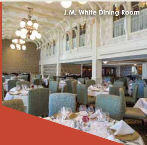
J.M. White Dining Room

Creating plates inspired by culinary classics of America's South and utilizing the best of the season's offerings from stops along the way, an award-winning culinary team lends its expertise to the unique dining experience on the American Queen . Indulge in the elegance of the J.M. White Dining Room, or satisfy your appetite any hour of the day at the Front Porch Café as you sample delectable creations, from pork loin stuffed with andouille sausage to corn fritters and bourbon pecan pie.