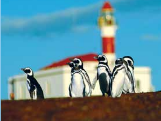
Magdalena Island in the Strait of Magellan is an important Magellanic penguin breeding site.