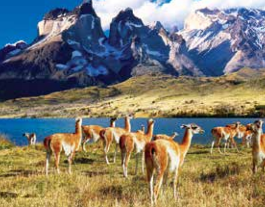
A relative of the domesticated llama, the wild guanaco is native to the Patagonian steppe.

Neither Queen's University nor Queen's University Alumni Association will be responsible for the financing, the arranging or the conducting of these tours. They assume no liability or responsibility for damages or financial loss to person or property of any description, that might occur in connection with these tours howsoever arising from the negligence, omission or otherwise of travel services arranged through Thomas P. Gohagan & Company.