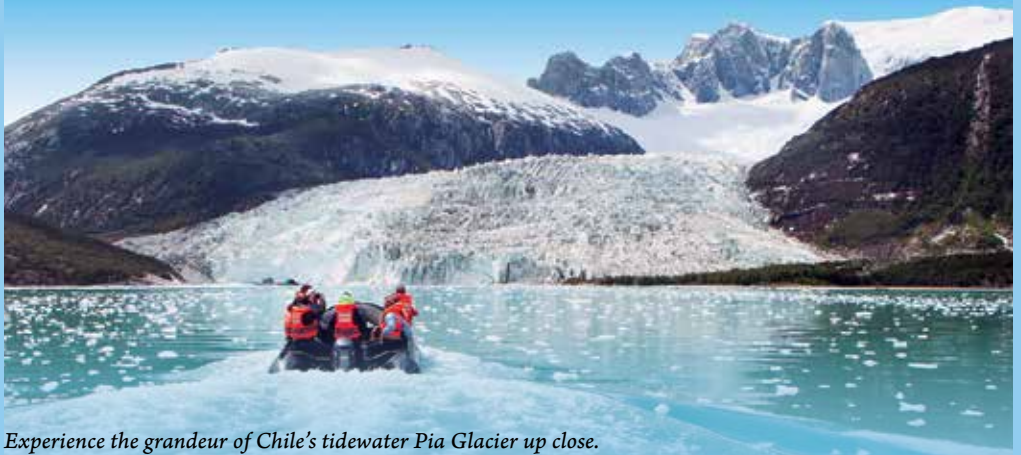
Experience the grandeur of Chile's tidewater Pia Glacier up close.

is fed by the retreating tidewater Marinelli Glacier and shelters an elephant seal colony. Board a Zodiac for a shore landing and walk among the subantarctic Magellanic forest's broadleaf trees. See the dramatic environmental effects of tens of thousands of beavers, descendants of the original 20 that were imported from North America in 1946.