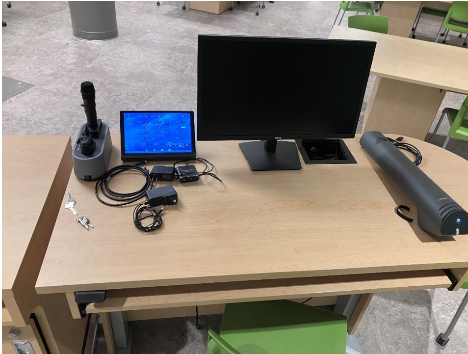
Image Description: Top-down view of the instructor's podium. The podium is equipped with a computer, a document camera and a set of microphones.

For more information about accessibility on campus, please refer to the Accessibility Hub or the Facilities Building Directory .