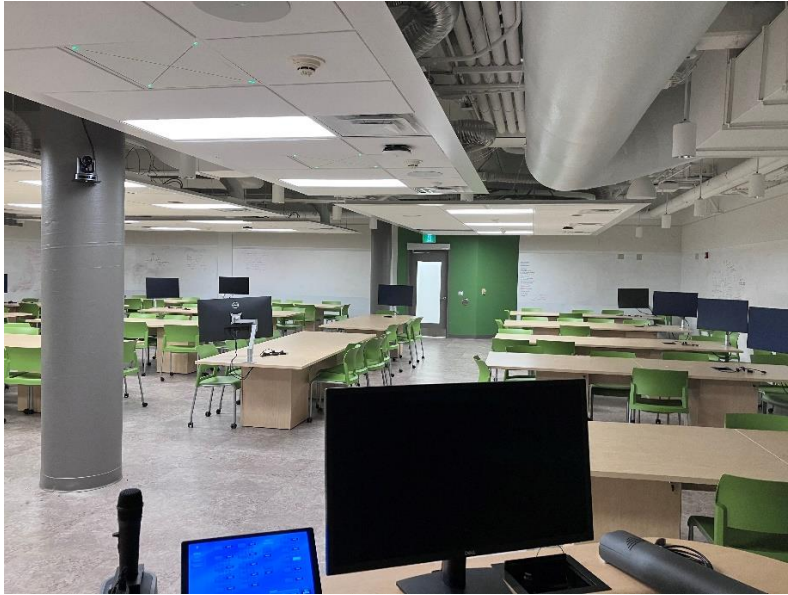
Image Description: View from the instructors podium at the front of the room. There are tables with 8 chairs each throughout the room. The room is accessible for students and the instructor. Whiteboards cover all walls in the room. There are projectors throughout the room at multiple points which project onto the whiteboards.