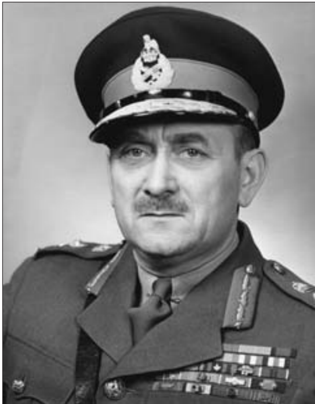
General Charles Foulkes.

Hellyer came to Defence convinced that the existing structure of command – with three separate service chains of command – was dated, and that new integrated commands were required. In the White Paper on Defence , Hellyer made much of the fact that the nature of war was changing rapidly, and it demanded new military organizational structures. General Charles Foulkes, who had been Chairman of the Chiefs of Staff Committee through the 1950s, had proposed in a 1961 paper, which he shared with Hellyer in 1963, the disbandment of the three services and their field forces, and the establishment of task forces commanded by a commander-in-chief, with the task forces organized to meet the particular circumstances dictated by the nature and scope of any international contribution accepted by the Canadian government. 7 Despite being retired, Foulkes was still highly regarded in government circles, and his ideas greatly influenced Hellyer, who gave the new integrated CFHQ defence staff the responsibility in 1964 for developing a field command structure suitable for the roles outlined for the CF in the new policy paper. 8