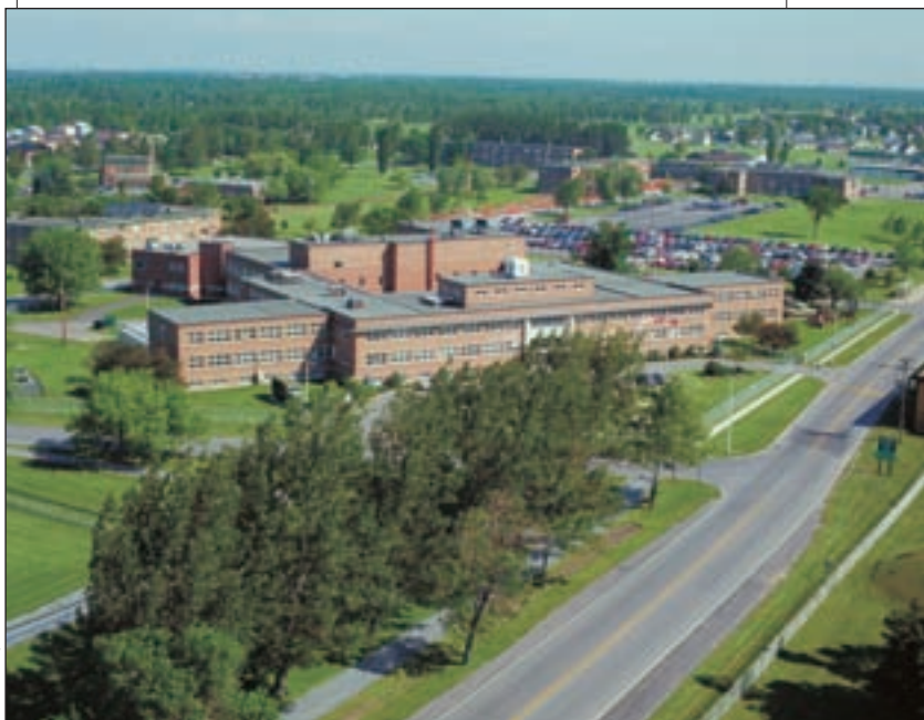
Mobile Command Headquarters St. Hubert, Quebec.