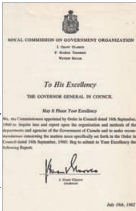
The Royal Commission on Government Reorganization

The focus upon efficiency that underlined several integration and unification initiatives was strongly reinforced by the implementation, in the early 1970s, of many recommendations of the influential Management Review Group study, the most notable being the merging of the CF and department headquarters into NDHQ. 34 During the 1980s and 1990s, faced with dwindling budgets, successive draconian cutbacks, and pressure from government central agencies, increasingly Defence adopted business practices, and accelerated the centralization of resources and the privatization of non-core defence functions to achieve more efficiency. As one expert on public administration observed, "[t]he political leadership virtually everywhere in the western world...concluded that management practices in the public sector should emulate the private sector or simply privatise the function." 35 The 'management era' reached its high-water mark in Defence with the 1997 MCCR initiative,