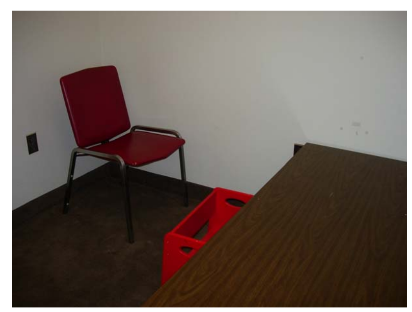
In the room there is a special red chair for you to sit in and a special red chair for your Mom or Dad to sit in. The researcher will ask you to sit in your chair and will ask you to do some work.