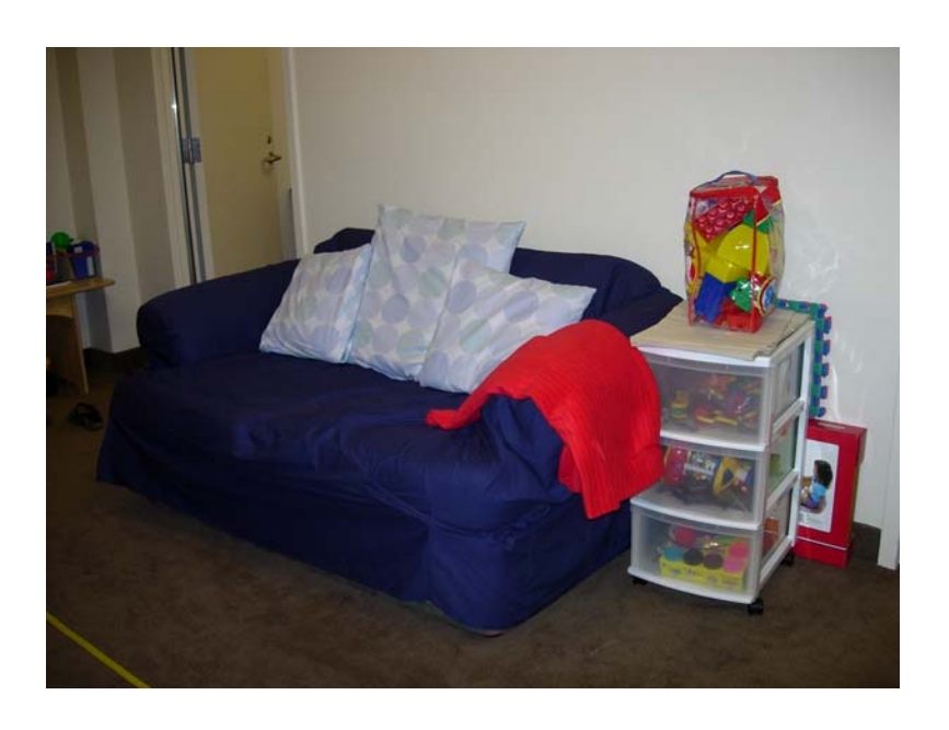
Here is a picture of our door. Our center has lots of fun toys.

The nice person will show you where our center is. You and your parents will walk down these stairs and go in these doors. Our center is through the doors on the left hand side.