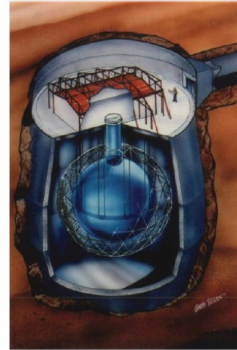
FIG. 1. (Color) Schematic of SNO detector.

We begin in Sec. II with an overview of the SNO detector and data analysis. In Sec. III we describe the data set used for the measurements made in the initial phase (hereafter Phase I) of SNO using \text{D}_2\text{O} without additives as the target-detector. Section IV describes the detector model ultimately used both to calibrate the neutrino data and to provide distributions used to fit our data. Section V describes the processing of the data, including all cuts applied, reconstruction of position and direction, and estimations of effective kinetic energy for each event. Section VI details the systematic uncertainties in the model, which translate into uncertainties in the neutrino fluxes. Section VII describes the measurement of backgrounds remaining in the data set, including neutrons from photodisintegration, the tails of low-energy radioactivity, and cosmogenic sources. Section VIII details the methods used to fit for the neutrino rates, and Sec. IX the ingredients that go into normalization of the rates. Sections X and XI present the