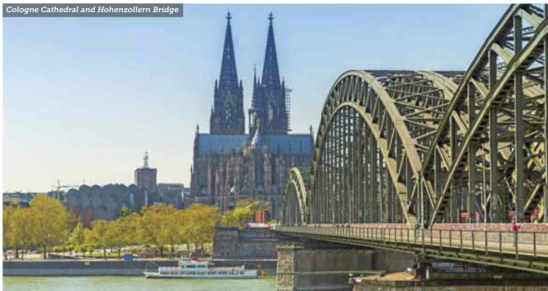
Cologne Cathedral and Hohenzollern Bridge