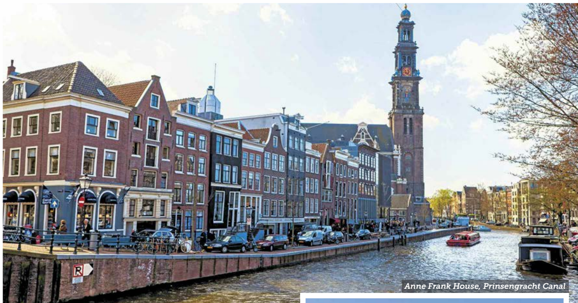
Anne Frank House, Prinsengracht Canal