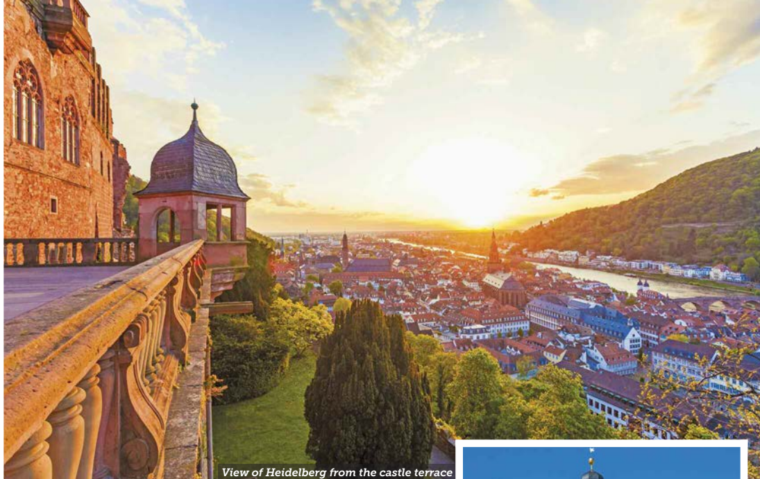
View of Heidelberg from the castle terrace