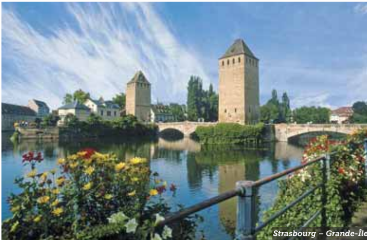
Strasbourg – Grande-Île