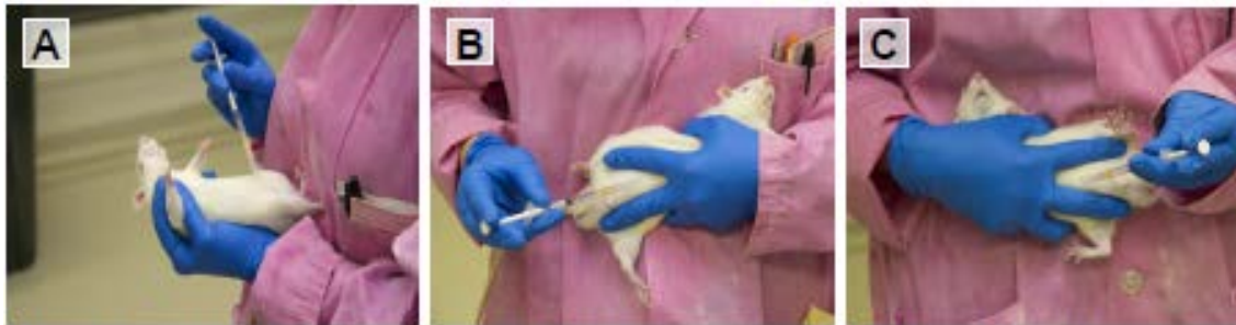
Figure 3. Novel hold for IP injections in rats. A) Standard suspender hold; B) Novel roll-over hold (right-handed user); C) Novel roll-over hold (left-handed user).

Alternative Intraperitoneal technique: This hold was developed for animals that are accustomed to handling. It alleviates stress to the animal, and allows for clear visualization of the needle hub.