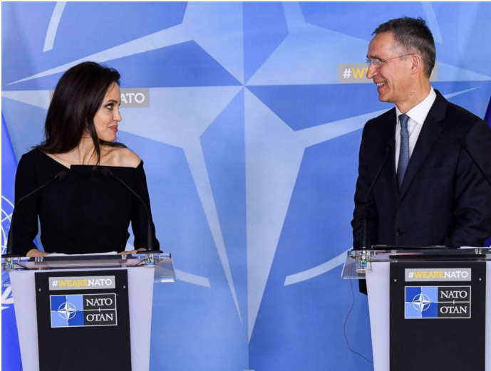
Special Envoy for the High Commissioner for Refugees Angelina Jolie and Secretary General of NATO Jens Stoltenberg. Brussels, January 31, 2018.