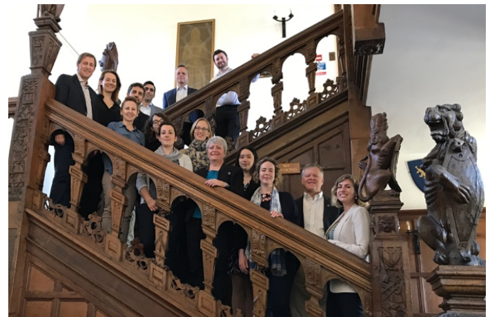
Attendees and participants at the Gender, Women, and International Security symposium, Bader International Study Centre, October 2017.