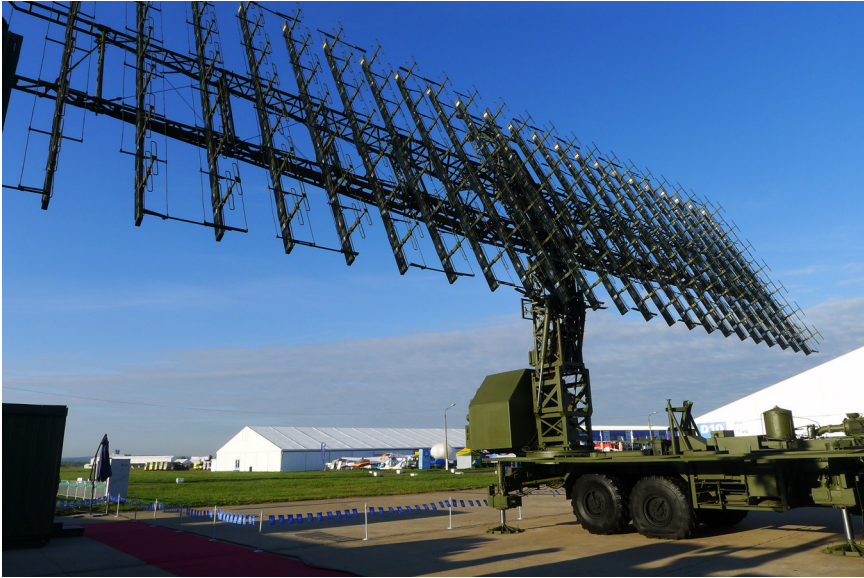
This Nizhny-Novogorod Research Institute (NNIIRT) 55Zh6ME radar system was on display at the August 2013 MAKS airshow at Zhukovsky, just outside of Moscow. It features VHF, L-band and S-band modules that are all part of an integrated radar system. Each module contains an active, electronically scanned array (AESA) radar.

Current Russian counter stealth radar technology rests on three pillars. The first is a heavy reliance on the VHF band for detection and cueing; the second is the adoption of state of the art technology, which includes the integration of commercial, off the shelf (COTS) hardware and software to improve cueing and fuse inputs from multiple sources; 17 and third is the addition of passive receivers 18 onto new systems as well as retrofitted onto older SAM systems.