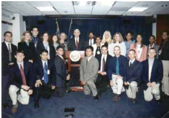
Internship at White House, Office of National Drug Control Policy