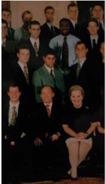
Internship at U.S. Department of State