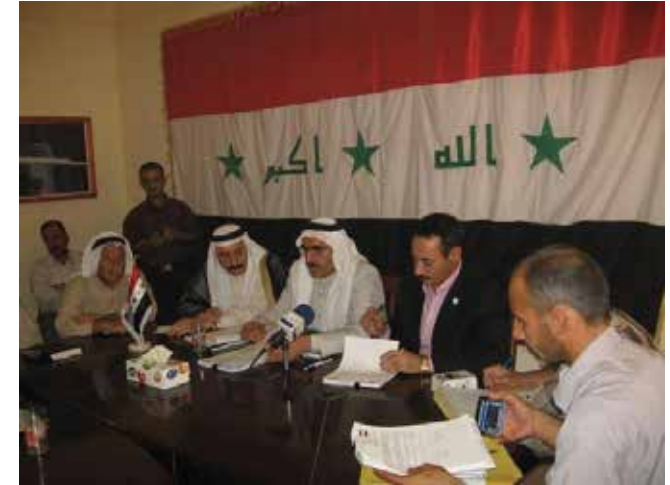
Assisted Iraqis Develop City Budget

“American strategy for Iraq consists of three basic tenets: clear, hold, and build. U.S. ground forces have been successful in clearing and holding key areas in Iraq; however, the last tenet, build, as of February 2007 has been the most complicated to implement...no clear linkage has existed between small-unit short-term goals and State Department and U.S. Agency for International Development (USAID) long-term development goals.”