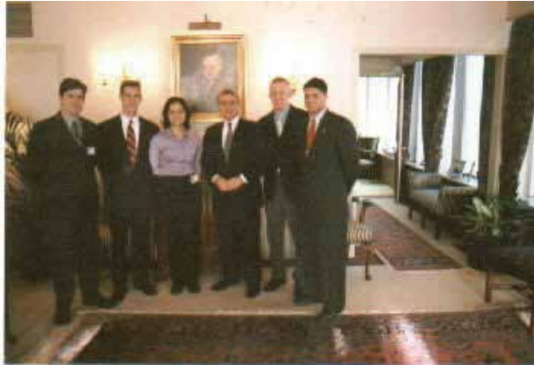
Internship at U.S. Embassy in London, UK