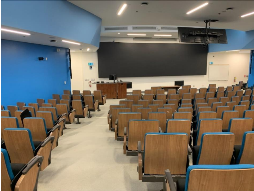
Image Description: This is the students view from the back of the room facing the podium. There are rows of seating with tablet arms, as well as tiers raising the rows of seats in the back of the room.