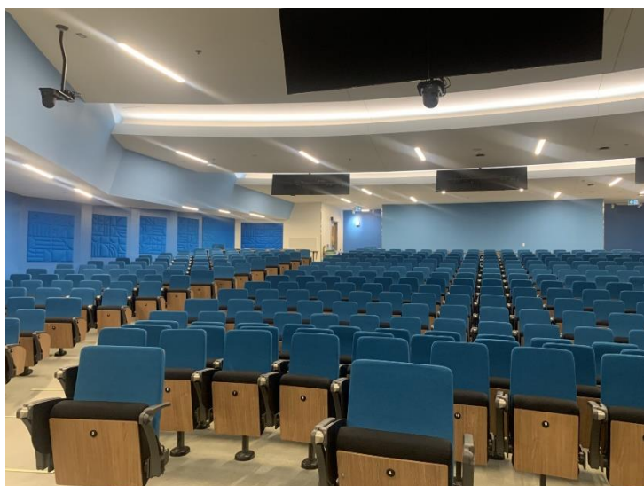
Image Description: This image is from the point of view of the instructor. There are rows of stationary seats as well as three spaces at the front of the room designated for wheelchair users. The room has a incline with the back of the room raised higher than the front.

For more information about accessibility on campus, please refer to the Accessibility Hub or the Facilities Building Directory .