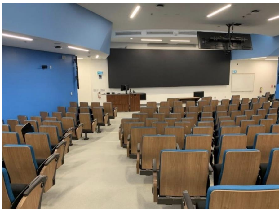
Image Description: This image depicts the students view when sitting at the rear of the room. There are rows of seating with tablet arms. The room slopes downwards towards the front of the room. There is accessible seating at the front and rear of the room. The instructor's podium is on the left, with video walls across the front of the room.

Image Description: Instructor's view of the classroom while standing at the front of the room. Seats are arranged in rows and are stationary. There are screens on the ceiling which displays media, mirroring the video wall at the front of the room. There are multiple exits in the room, at the front and the rear of the room.