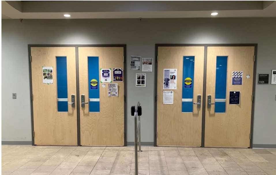
Image Description: Image of doors that enter to room 1101 in Biosciences Complex. There are two sets of double doors that have metal handles at the center of the doors. The entrance can be controlled by an automatic door opener.