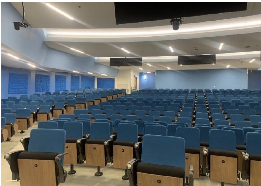
Image Description: Instructor's view of the classroom while standing at the front of the room. Seats are arranged in rows and are stationary. There are screens on the ceiling which displays media, mirroring the video wall at the front of the room. There are multiple exits in the room, at the front and the rear of the room.