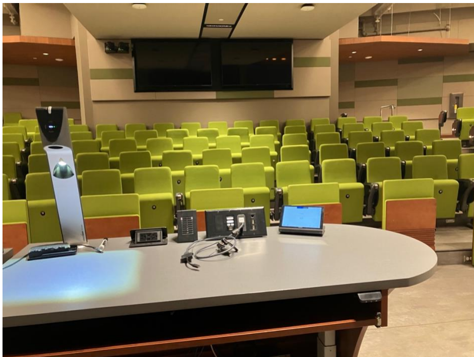
Image Description: View of the classroom from the instructor's podium. Rows of seating are tiered, and each seat had a tablet arm. The entryway door is located at the rear of the room. This classroom is accessible for instructors.

Image Description: Entryway door to Biosciences complex, room 1102. There are two sets of double doors with handles that pull to open. Both doors can be opened by pressing the automatic door opener beside the entrance.