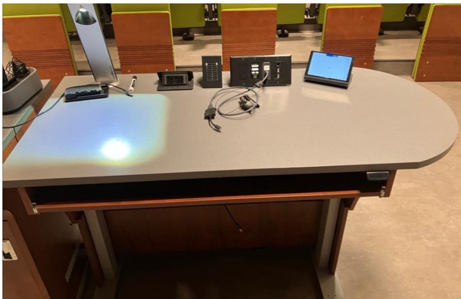
Image Description: Top down view of the podium. This podium is equipped with a set of microphones, a document camera, lecture capture and wireless presentation. The podium is height adjustable.

Image Description: View of the classroom from a student seat at the rear of the room. Instructor's podium is located at the front of the room. A whiteboard is located on the right wall, close to the instructor's podium. There are three video walls at the front of the room. This classroom is accessible for students.