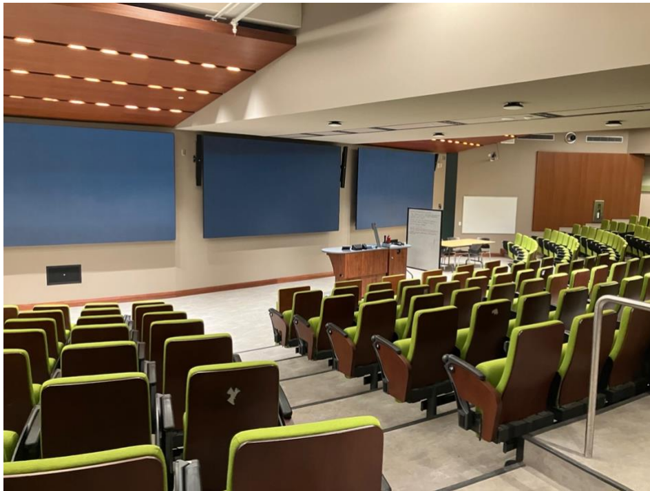
Image Description: View of the classroom from a student seat at the rear of the room. Instructor's podium is located at the front of the room. A whiteboard is located on the right wall, close to the instructor's podium. There are three video walls at the front of the room. This classroom is accessible for students.