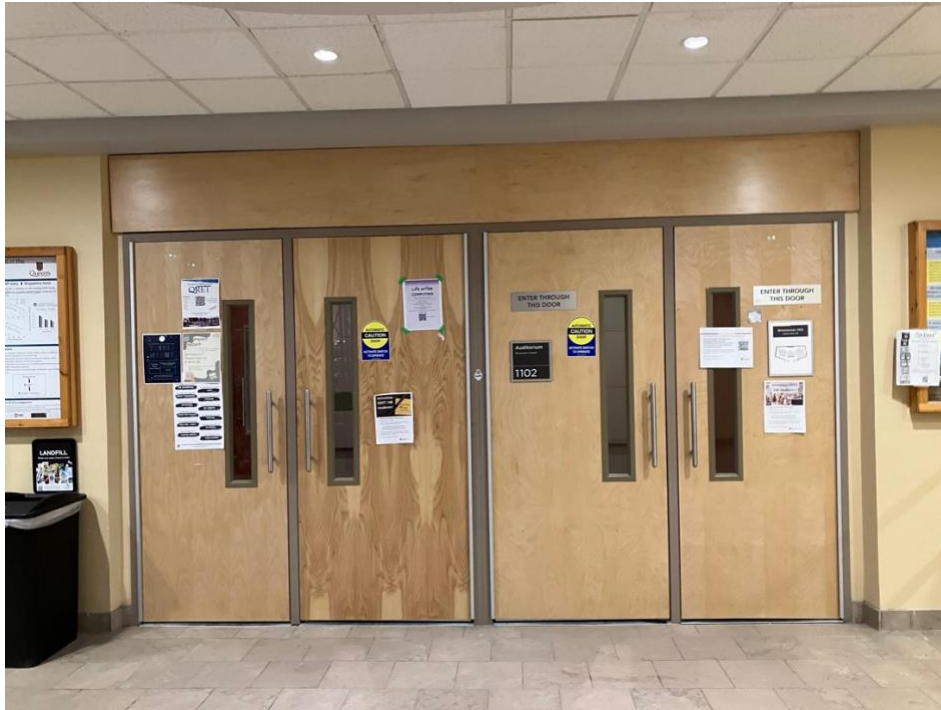
Image Description: Entryway door to Biosciences complex, room 1102. There are two sets of double doors with handles that pull to open. Both doors can be opened by pressing the automatic door opener beside the entrance.