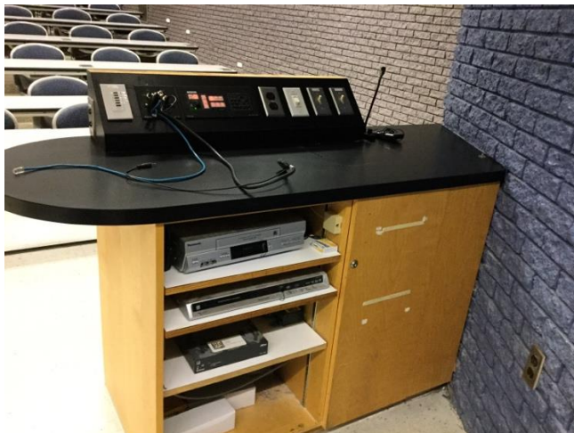
Image Description: Image of the wooden podium at the front of the classroom. This podium is not movable or height adjustable. This podium is not accessible.

Image Description: Entryway door to the Botterell B139 classroom. Door is blue with a lever on the right side.