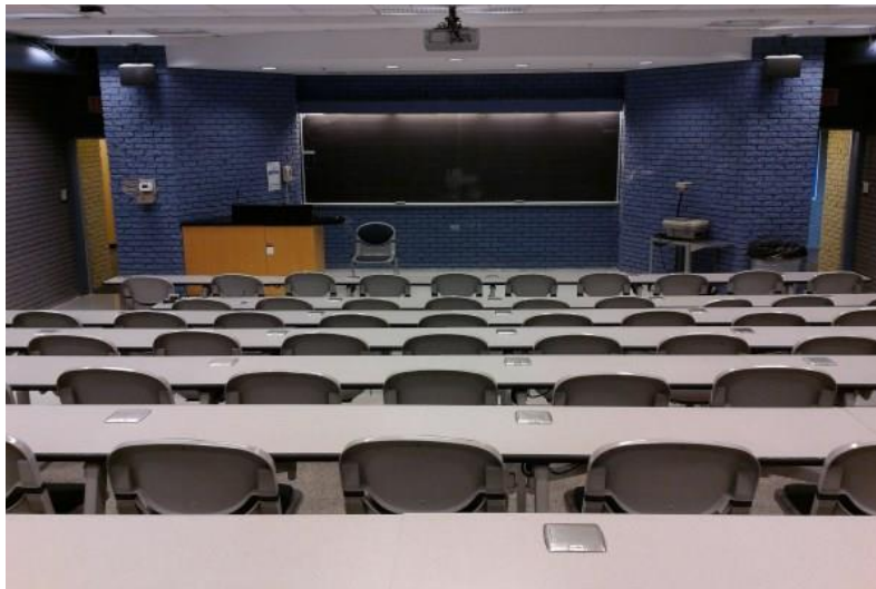
Image Description: View of the classroom from a student seat near the rear of the room. In front are six empty rows of tables and chairs. The instructor's podium is at the front of the room on the left. The front of the classroom has a large blackboard spanning the entire front wall. A digital projector on the ceiling projects onto a screen that can be pulled down from the ceiling at the front of the room. This classroom is accessible for students.

Image Description: View of the classroom from the instructor's podium. 10 long tables with chairs for students. Tables are arranged in rows from front to back with eight tiered steps to access tables in the middle and back area of the classroom. The entryway door is located in the left side of the image, at the front of the classroom. This classroom is accessible for instructors.