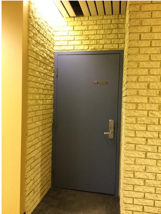
Image Description: Entryway door to the Botterell B139 classroom. Door is blue with a lever on the right side.