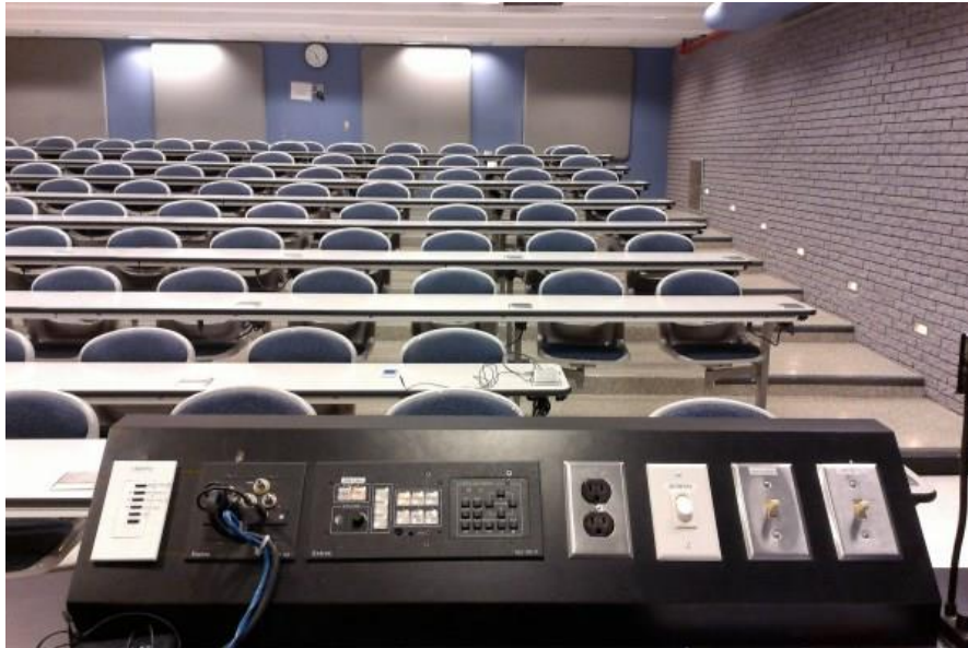
Image Description: View of the classroom from the instructor's podium. 10 long tables with chairs for students. Tables are arranged in rows from front to back with eight tiered steps to access tables in the middle and back area of the classroom. The entryway door is located in the left side of the image, at the front of the classroom. This classroom is accessible for instructors.