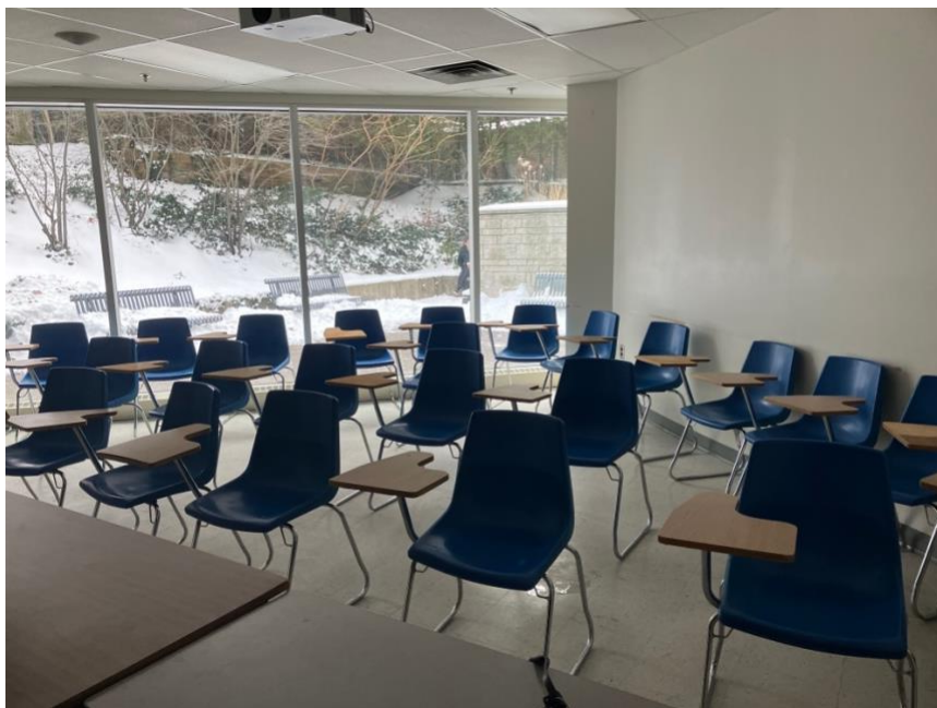
Image Description: View of the classroom from the instructor's podium. There are multiple chairs with small desks attached that can be arranged according to the instructor's preference. This classroom is accessible for instructors.