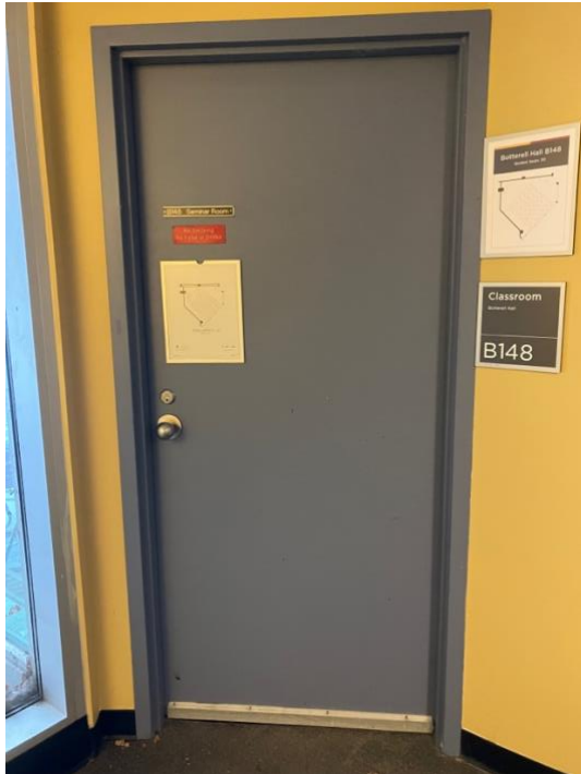
Image Description: The entryway of room B148 in Botterell Hall is a blue door with a silver doorknob on the left side.