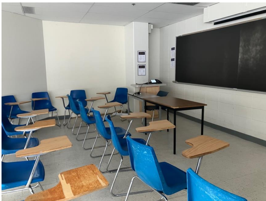
Image Description: View of the classroom from a student seat near the rear of the room. In front are multiple empty chairs. The wall podium is at the front of the room on the left. The front of the classroom has a large blackboard that located on the front wall. A digital projector on the ceiling projects onto a screen that pulls down from the ceiling. This classroom is accessible for students.

For more information about accessibility on campus, please refer to the Accessibility Hub or the Facilities Building Directory .