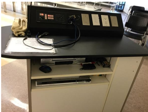
Image Description: Image of the podium at the front of the classroom, on the right-hand side. A phone is located on the left side of the podium. This podium is not moveable or height adjustable. This podium is not accessible.

Image Description: Entryway door to Chernoff Hall room 211 classroom. Doorway is a wooden double door, with a handle on the right door.