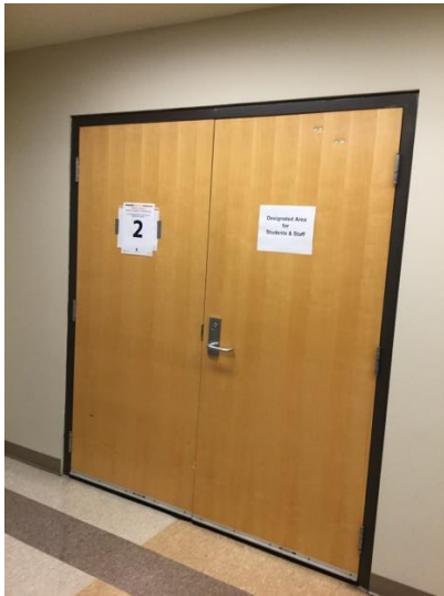
Image Description: Entryway door to Chernoff Hall room 211 classroom. Doorway is a wooden double door, with a handle on the right door.