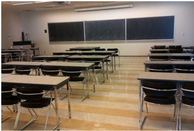
Image Description: View of the classroom from a student seat at the rear of the room. Instructor's podium is located at the front of the room on the left-hand side (from a student's point of view). Three blackboards are located on the front wall. A digital projector on the ceiling projects onto a screen, which extends from the ceiling. The entryway door is located on the right side of the image. This classroom is accessible for students.

Image Description: View of the classroom from the instructor's podium. The classroom has multiple desks and chairs, that can be arranged according to the instructor's preference. The entryway door is located at the front of the classroom on the left-hand side. This classroom is accessible for instructors.