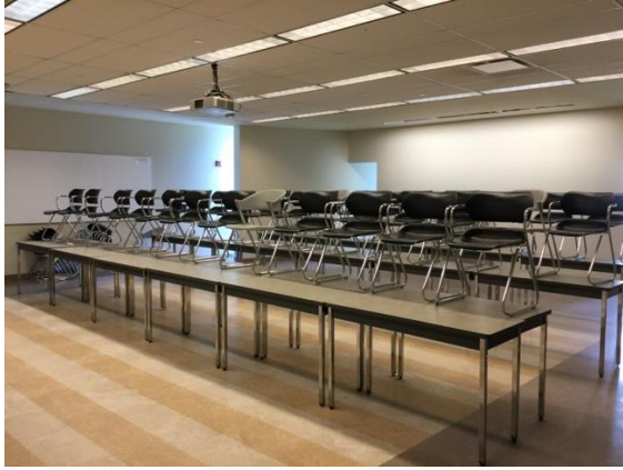
Image Description: View of the classroom from the instructor's podium. The classroom has multiple desks and chairs, that can be arranged according to the instructor's preference. The entryway door is located at the front of the classroom on the left-hand side. This classroom is accessible for instructors.