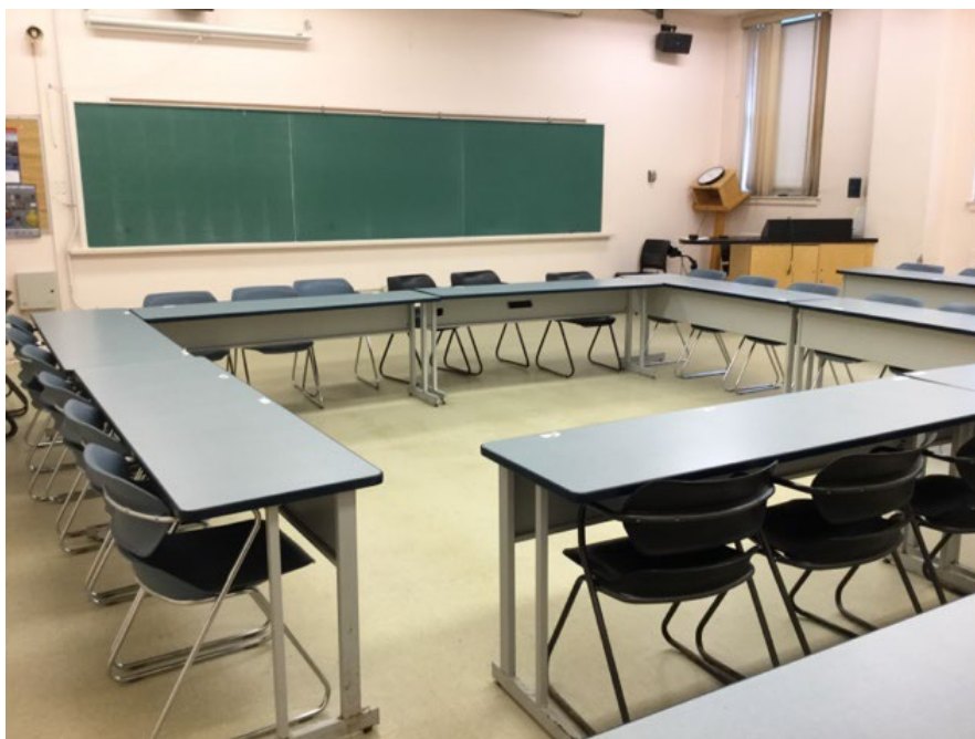
Image Description: View of the classroom from a student seat near the rear of the room. In front are empty student tables and chairs arranged in a large square. The instructor podium is at the front of the room on the right. The front of the classroom has a large blackboard in the middle of the front wall. A digital projector on the ceiling, project onto a screen on the front wall. This classroom is accessible for students.

Image Description: The entryway of room 10 in Dunning Hall is a beige door with a doorknob on the left side.