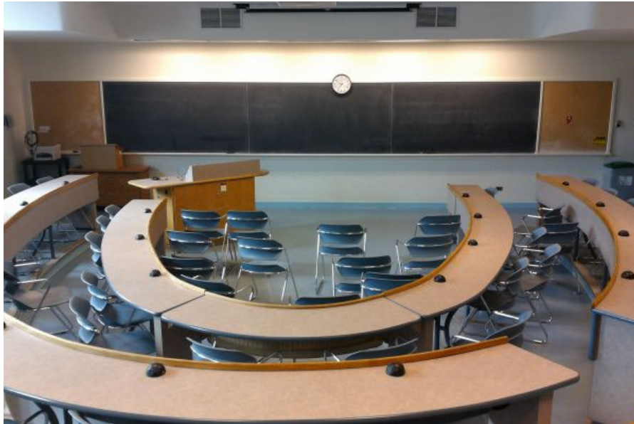
Image Description: View of the classroom from a student seat near the rear of the room. In front are three empty rows of tables and chairs. The instructor podium is at the front of the room on the right. The front of the classroom has a large blackboard in the middle of the front wall. A digital projector on the ceiling, project onto a screen that extends from the ceiling. The front area of this classroom is accessible for students.