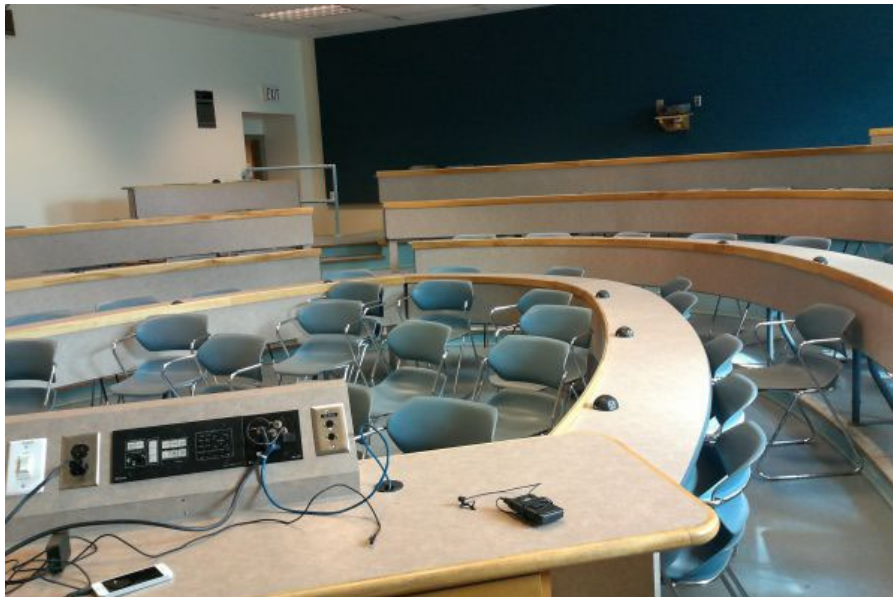
Image Description: View of the classroom from the instructor's podium. There are long curved tables with chairs for students. Tables are arranged in rows from front to back with tiered steps to access tables in the middle and back area of the classroom. This classroom is accessible for instructors.

Image Description: The entryway of room 12 in Dunning Hall is a beige double door with a silver handle on the right door.