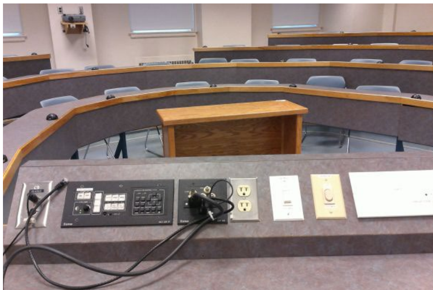
Image Description: View of the classroom from the instructor's podium. There are four rows of long curved tables with chairs for students. Tables are arranged in rows from front to back with tiered steps to access seats in the middle and back area of the classroom. This classroom is accessible for instructors.

Image Description: The entryway of room 27 in Dunning Hall is a beige door with a silver doorknob on the left side.