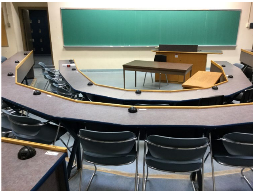
Image Description: View of the classroom from a student seat near the rear of the room. In front are empty rows of tables and chairs. The instructor podium is at the front of the room in the middle. The front of the classroom has a long blackboard in the middle of the front wall. A projector on the ceiling projects an image on a screen that comes down from the ceiling at the front of the room. The front area of this classroom is accessible for students.