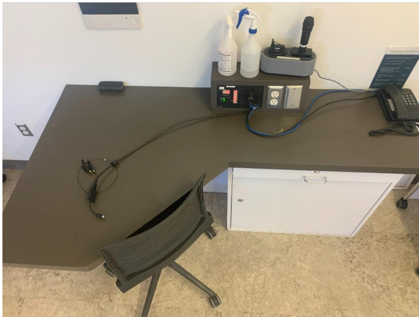
Image Description: Podium is equipped with a phone, an outlet, lecture capture and a set of microphones. There is a phone located on the right side of the desk.

Image Description: The entryway of classroom 319 in Ellis Hall is a grey door with a silver handle on the right side of the door.