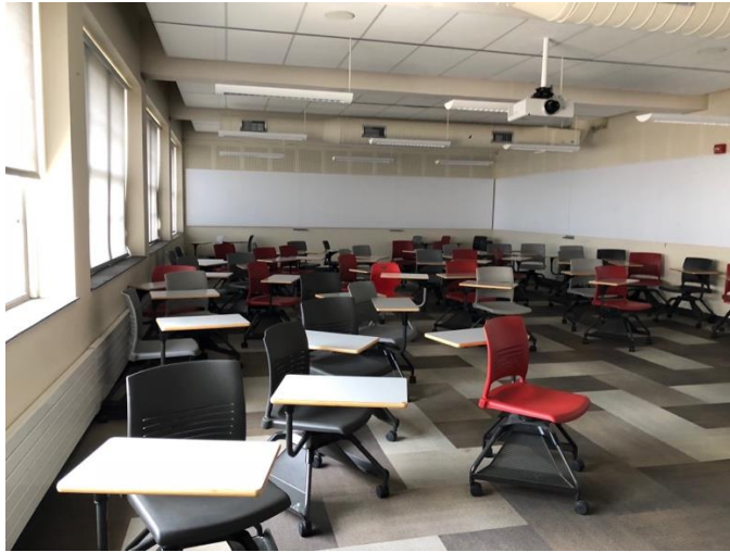
Image Description: View of the classroom from the instructor's podium. There are multiple chairs with tables attached for students. Chairs can be arranged according to instructor's preference. This classroom is accessible for instructors.

For more information about accessibility on campus, please refer to the Accessibility Hub or the Facilities Building Directory .