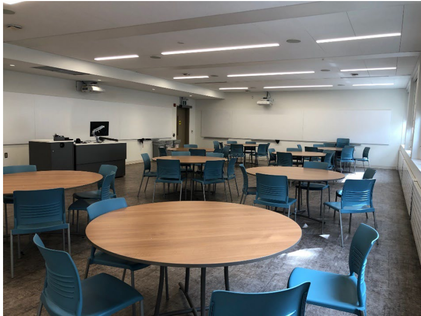
Image Description: View of the classroom from a student seat near the rear of the room. In front are multiple round tables and chairs. The instructor podium is at the front of the room in the middle. The front and side walls have long whiteboards with digital projectors that project onto the whiteboard surface. This classroom is accessible for students.