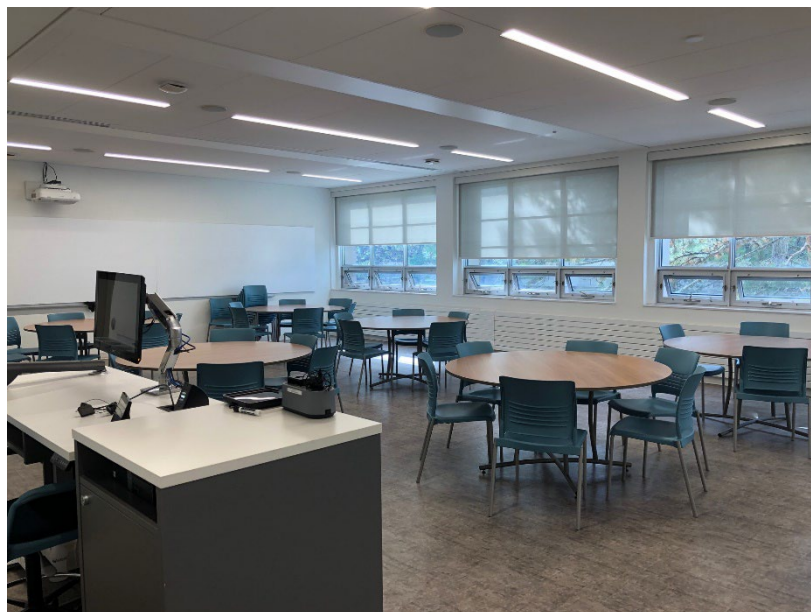
Image Description: View of the classroom from the instructor's podium. There are round tables with chairs for students. The left wall is covered in a long whiteboard with a digital projector that projects onto the whiteboard. The back of the classroom has windows along the back wall. This classroom is accessible for instructors.

Image Description: The entryway door of room 226 in Ellis Hall is a grey door with a silver lever handle on the right side. A thin glass window is in the upper half of the door. An accessible automatic door button is located on the wall to the right of the door.