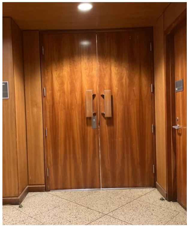
Image Description: Entrance to auditorium in Ellis Hall. The entrance is a set of wooden double doors and each has a handle.