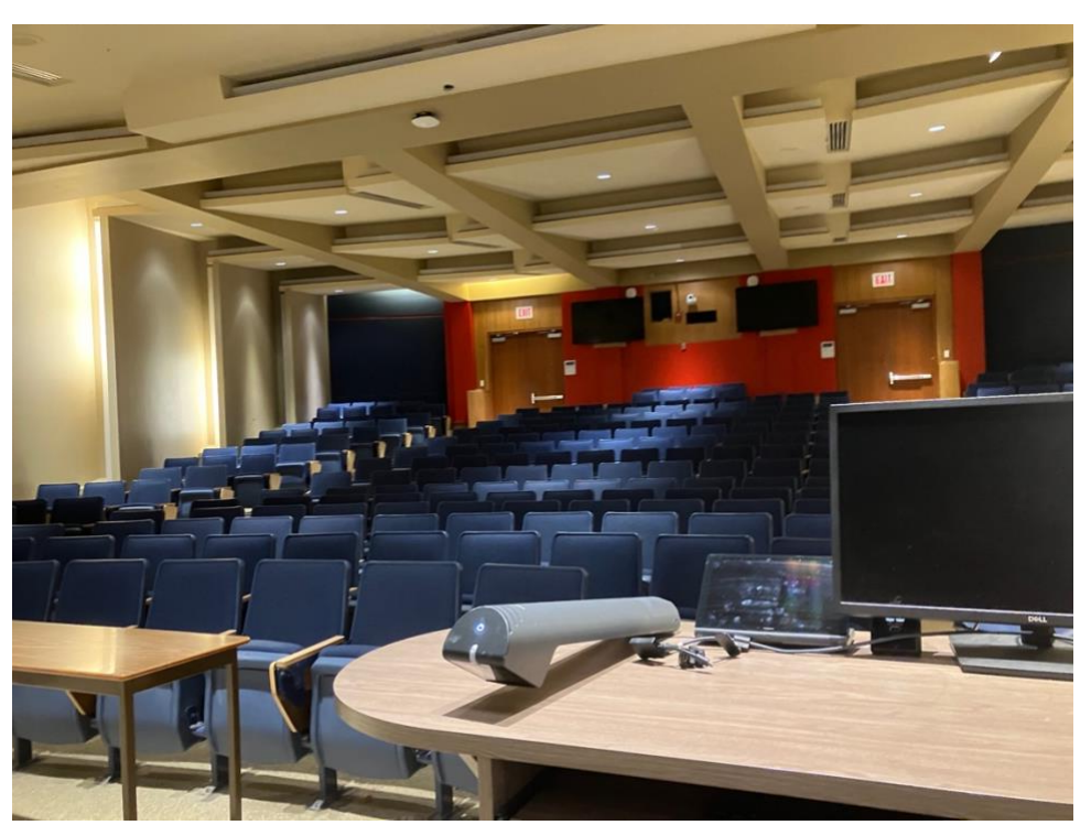
Image Description: View of the classroom from the instructor's podium. There are 14 rows chairs for students. Chairs are arranged in rows from front to back with tiered steps to access seats in the middle and back area of the classroom. This classroom is accessible for instructors.