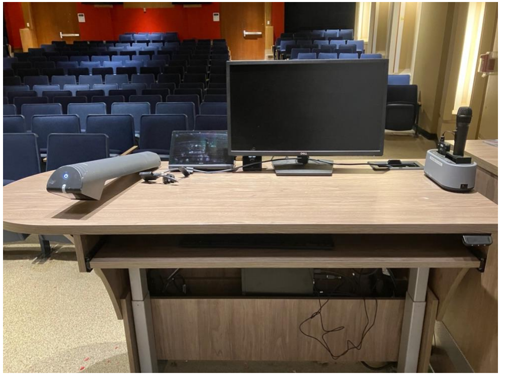
Image Description: The instructor's podium is equipped with a computer, a document camera and a set of microphones. The podium is height adjustable and accessible for instructors.