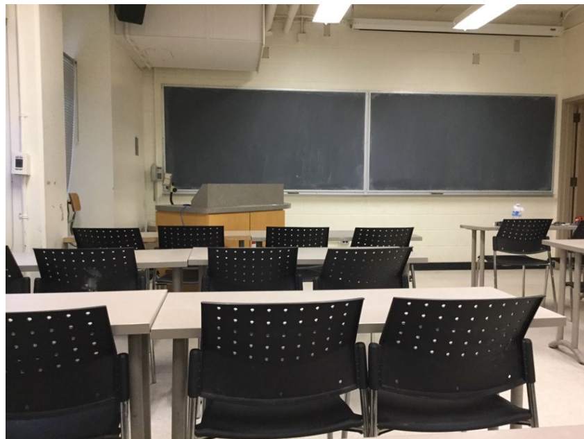
Image Description: View of the classroom from a student seat near the rear of the room. In front are empty rows of movable tables and chairs. The instructor podium is at the front of the room on the left. The front of the classroom has two blackboards across the front wall. A digital projector on the ceiling, projects onto a screen that extend from the ceiling. This classroom is accessible for both instructors and students.

Image Description: The entryway of room 247 in Goodwin Hall is a single beige door with a doorknob on the left side of the door.