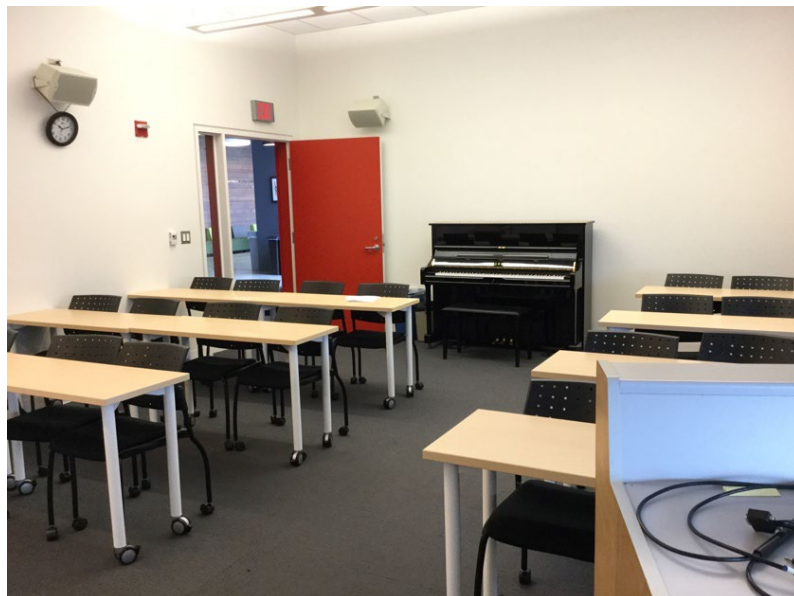
Image Description: View of the classroom from the instructor's podium. The classroom has movable tables and chairs for students. The entryway door is located at the back of the classroom on the left side. This classroom is accessible for instructors.

Image Description: The entryway door of room 312 in the Isabel Bader Center for Performing Arts is an orange door with a silver lever handle on the right side.