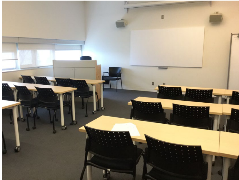
Image Description: View of the classroom from a student seat near the rear of the room. In front are multiple rows of movable tables and chairs. The instructor's podium is at the front of the room on the left. A digital projector on the ceiling, projects onto a screen that extends from the ceiling. A whiteboard is located in the middle of the front wall of the classroom. This classroom is accessible for students.