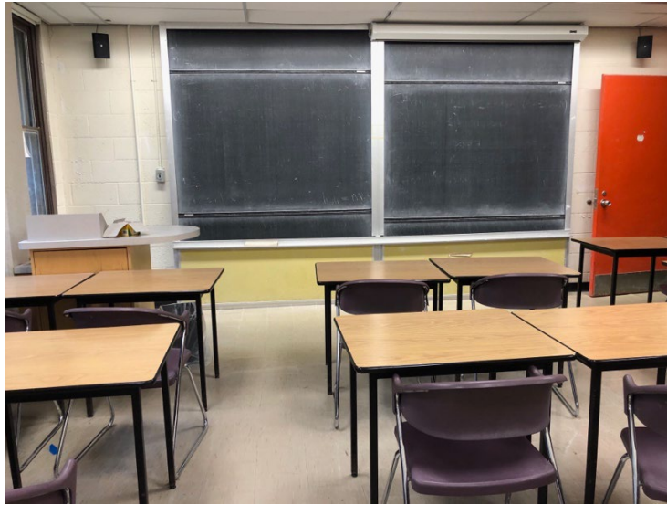
Image Description: View of the classroom from a student seat near the rear of the room. In front are empty rows of tables and chairs. The instructor podium is at the front of the room on the left. Two sliding blackboard panels are located on the front wall. A projector on the ceiling projects onto a screen that extends from the ceiling. This classroom is accessible for students.