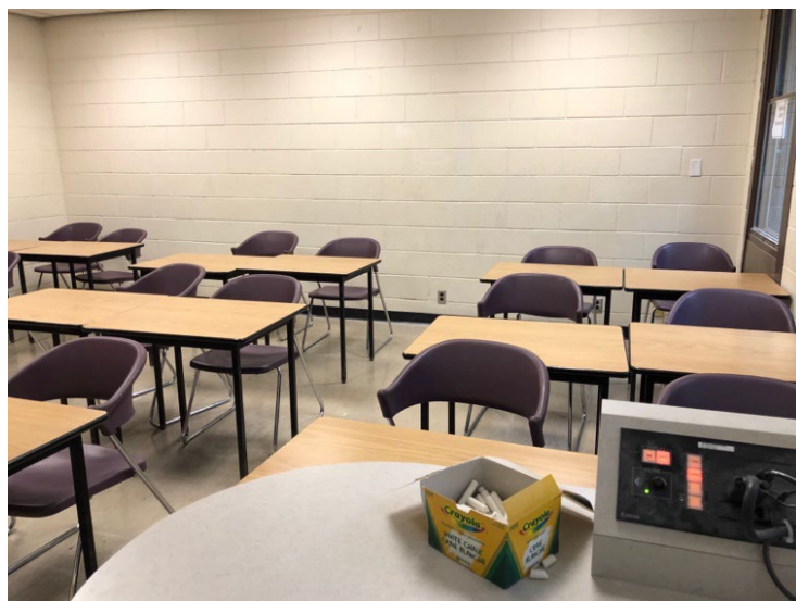
Image Description: View of the classroom from the instructor's podium. There are movable tables with chairs for students, arranged in rows. The entryway door is located on the right side of the classroom. This classroom is accessible for instructors.

Image Description: The entryway door of room 319 in Jeffery Hall is a single red door with a doorknob on the left side.