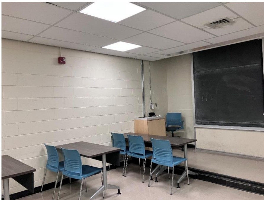
Image Description: View of the classroom from a student seat near the rear of the room. In front are four empty rows of tables and chairs. The instructor podium is at the front of the room on the left. The front of the classroom has a three large blackboard panels in the middle of the front wall. A digital projector on the ceiling, projects onto a screen that extends from the ceiling. This classroom is accessible for students.

For more information about accessibility on campus, please refer to the Accessibility Hub or the Facilities Building Directory .