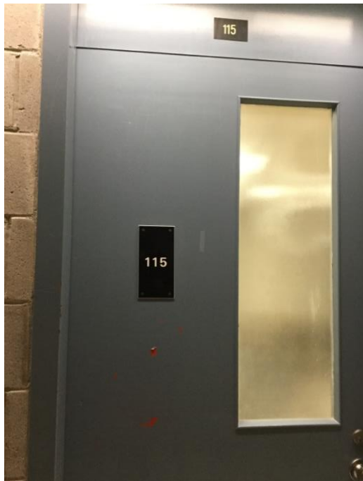
Image Description: The entryway of room 115 in Jeffrey Hall is a grey door with a silver doorknob on the right side.