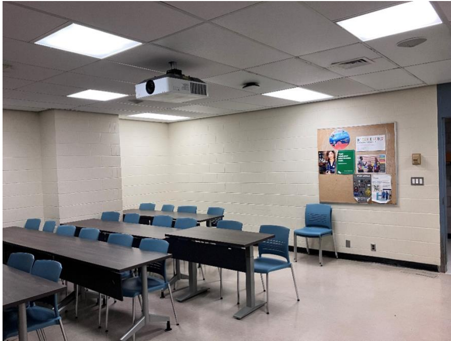
Image Description: View of the classroom from the instructor's podium. There are four rows of tables with chairs for students. The entryway door is located at the back of the room, on the right side. This classroom is not accessible for instructors.