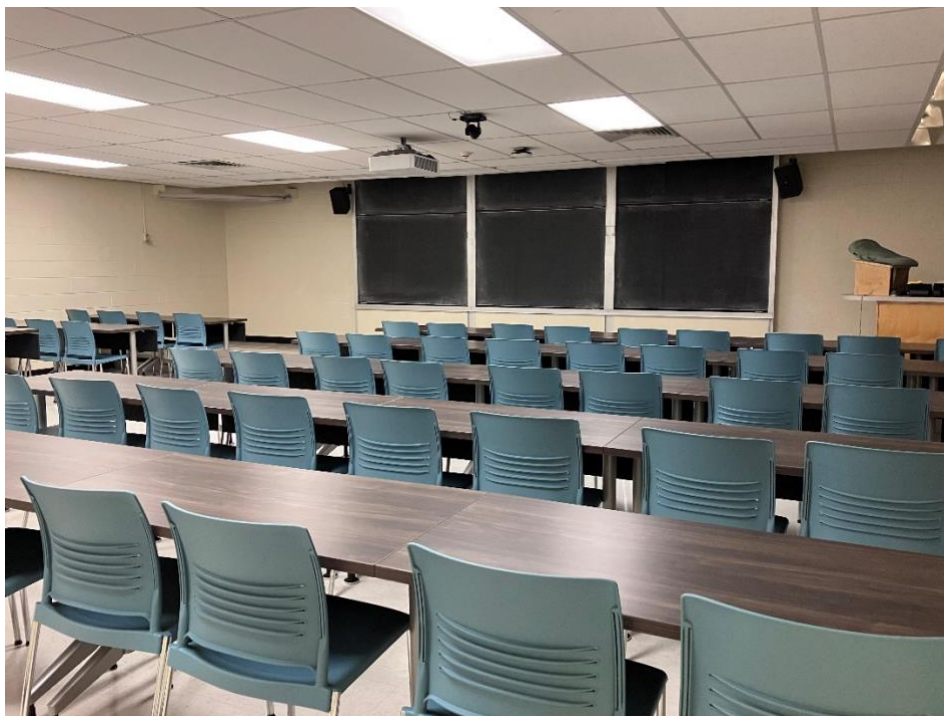
Image Description: View of the classroom from a student seat near the rear of the room. In front are multiple empty rows of tables and chairs. The instructor podium is at the front of the room on the left. Three large sliding blackboard panels are located on the front wall. A projector on the ceiling projects onto a screen that extends from the ceiling. This classroom is accessible for students.

For more information about accessibility on campus, please refer to the Accessibility Hub or the Facilities Building Directory .