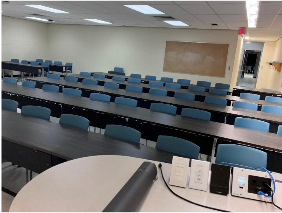
Image Description: View of the classroom from the instructor's podium. There are eight rows of long tables with chairs for students. The entryway door is located on the left side of the classroom. This classroom is not accessible for instructors.