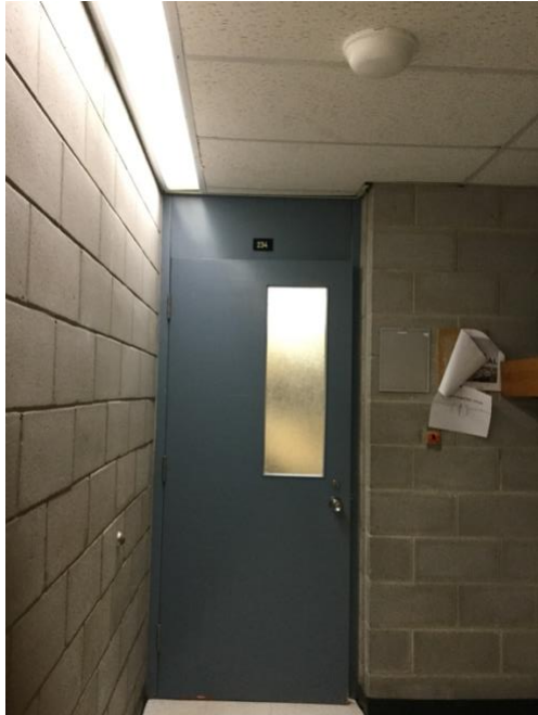
Image Description: The entryway of room 234 in Jeffrey Hall is a door with a silver doorknob on the right door.