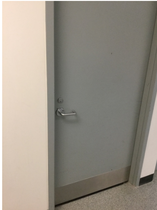
Image Description: The entryway door of room 102 in Kinesiology Hall is a grey door with a lever handle on the left side.