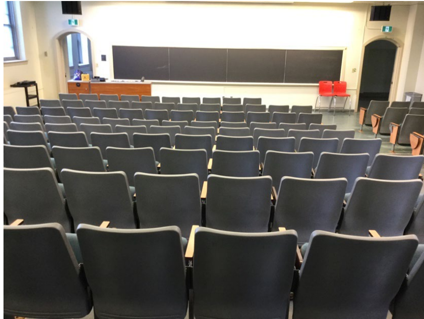
Image Description: View of the classroom from a student seat near the rear of the room. In front are multiple empty rows of chairs. The instructor's podium is located at the front of the room on the left. A long blackboard is located on the front wall. A projector on the ceiling projects onto a screen that extends from the ceiling. The front area of this classroom is accessible for students.