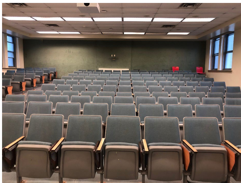
Image Description: View of the classroom from the instructor's podium. There are rows of auditorium chairs for students. This classroom is tiered for access to the middle and back areas of the room. This classroom is accessible for instructors.

Image Description: The entryway of room 201 in Kingston Hall is a beige wooden door with a handle on the right side.