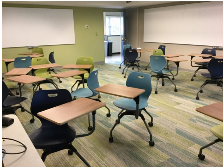
Image Description: View of the classroom from the instructor's podium. There are movable chairs for students with tablet desks, that can be arranged according to the instructor's preference. Whiteboards are located on the back and right walls of the classroom. The entryway door is located at the back of the classroom, on the right. This classroom is accessible for instructors.

Image Description: The entryway of room A309 in Mackintosh Corry Hall is a blue door with a doorknob on the right side.