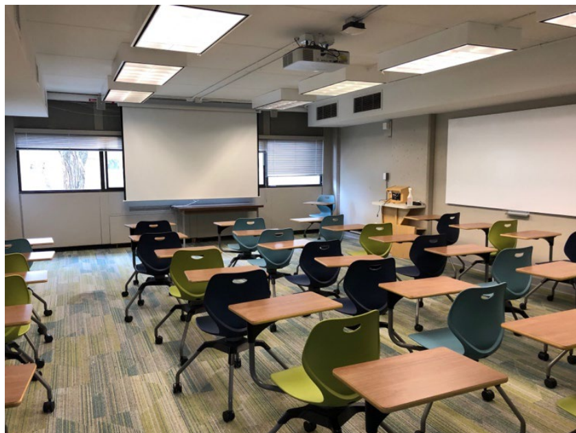
Image Description: View of the classroom from a student seat near the rear of the room. In front are empty movable chairs with tables attached. The instructor's wall podium is located at the front of the room on the right. A projector on the ceiling projects onto a screen that extends from the ceiling, at the front of the room. This classroom is accessible for students.