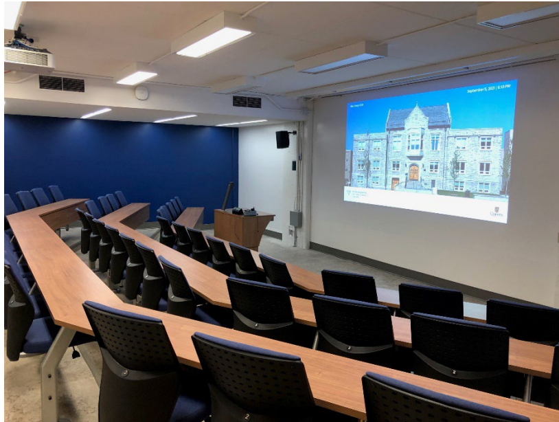
Image Description: View of the classroom from a student seat near the rear of the room. In front are rows of wood tables and blue chairs. The instructor's podium is at the front of the room on the left. The front wall of the classroom is covered in a whiteboard surface. A digital projector on the ceiling projects onto the whiteboard surface at the front of the classroom.