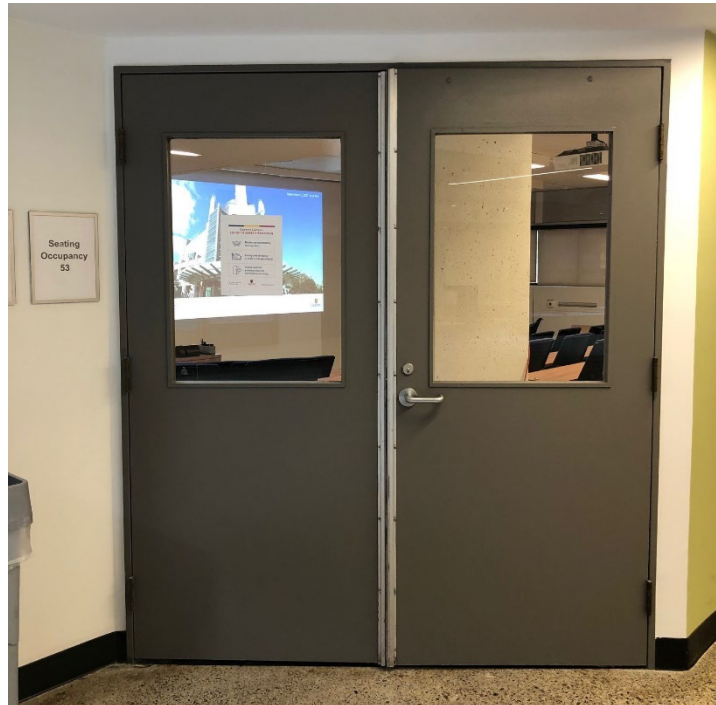
Image Description: The entryway door of room D214 in Mackintosh Corry Hall is a double grey door with a lever handle on the right door.