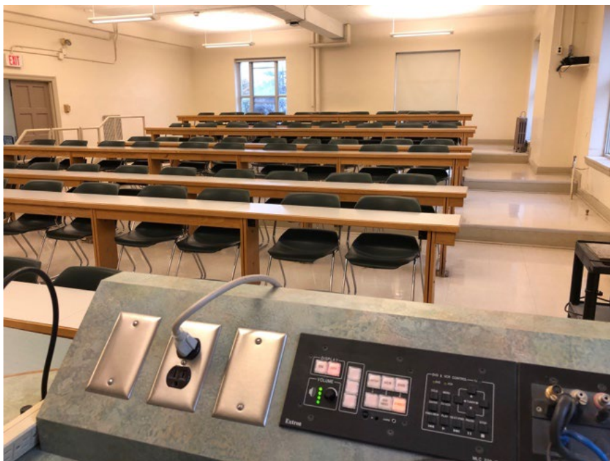
Image Description: View of the classroom from the instructor's podium. There are rows of long tables with chairs for students. Tables are arranged in rows from front to back with tiered steps to access tables in the middle and back area of the classroom. The entryway door is located at the left side of the image.

Image Description: The entryway of room 306 in McLaughlin Hall is a double door with a silver doorknob on the right door.