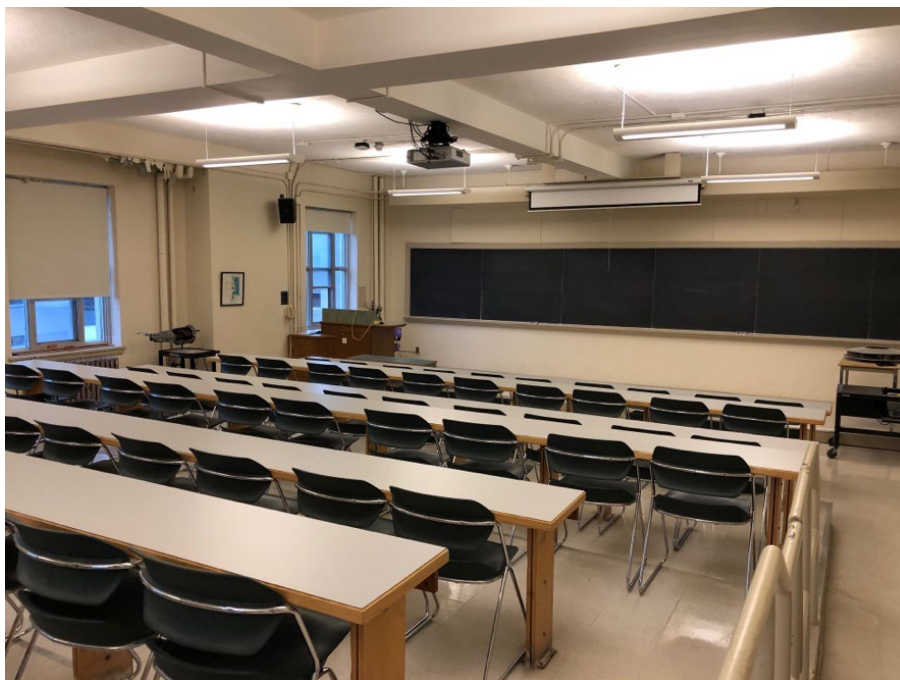
Image Description: View of the classroom from a student seat near the rear of the room. In front are multiple empty rows of tables and chairs. The instructor podium is at the front of the room on the left. The front of the classroom has a large blackboard in the middle of the front wall. A digital projector on the ceiling, projects onto a screen that extends from the ceiling. The front area of this classroom is accessible for students.