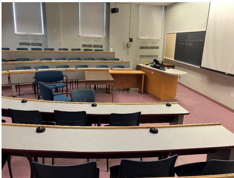
Image Description: View of the classroom from a student seat near the rear of the room. In front are four empty rows of tables and chairs. The instructor podium is at the front of the room on the left. The front of the classroom has a long blackboard in the middle of the front wall. A digital projector on the ceiling, projects onto a screen that extends from the ceiling. This classroom is accessible for students.

Image Description: View of the classroom from the instructor's podium. There are four rows of long curved tables with chairs for students. Tables are arranged in rows from front to back with tiered steps to access tables in the middle and back area of the classroom. This classroom is accessible for instructors.