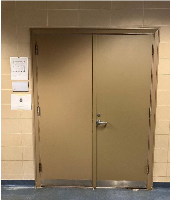
Image Description: The entryway of room 11 in Dunning Hall is a tan double door with a silver handle on the right door.