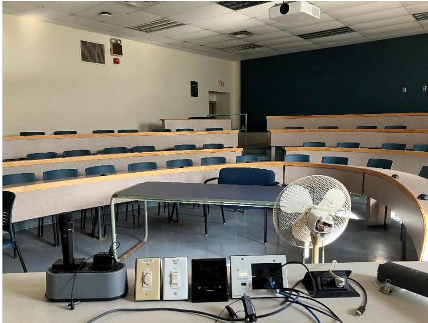
Image Description: View of the classroom from the instructor's podium. There are four long curved tables with chairs for students. Tables are arranged in rows from front to back with tiered steps to access tables in the middle and back area of the classroom. The entryway door is located at the back left corner of the classroom. This classroom is accessible for instructors.