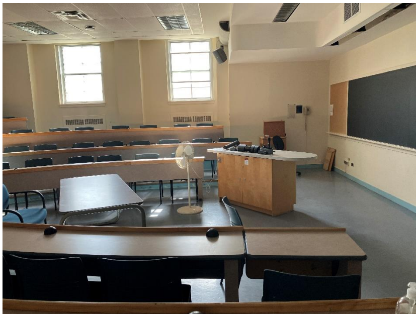
Image Description: View of the classroom from a student seat near the rear of the room. In front are three empty rows of tables and chairs. The instructor podium is at the front of the room on the right. The front of the classroom has a large blackboard in the middle of the front wall. A digital projector on the ceiling, project onto a screen that extends from the ceiling. This classroom is accessible for students.

Image Description: View of the classroom from the instructor's podium. There are four long curved tables with chairs for students. Tables are arranged in rows from front to back with tiered steps to access tables in the middle and back area of the classroom. The entryway door is located at the back left corner of the classroom. This classroom is accessible for instructors.