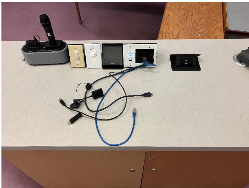
Image Description: Image of the podium at the front of the classroom. This podium is not movable or height adjustable. This podium is not accessible.

Image Description: The entryway of room 12 in Dunning Hall is a tan double door with a silver handle on the right door.