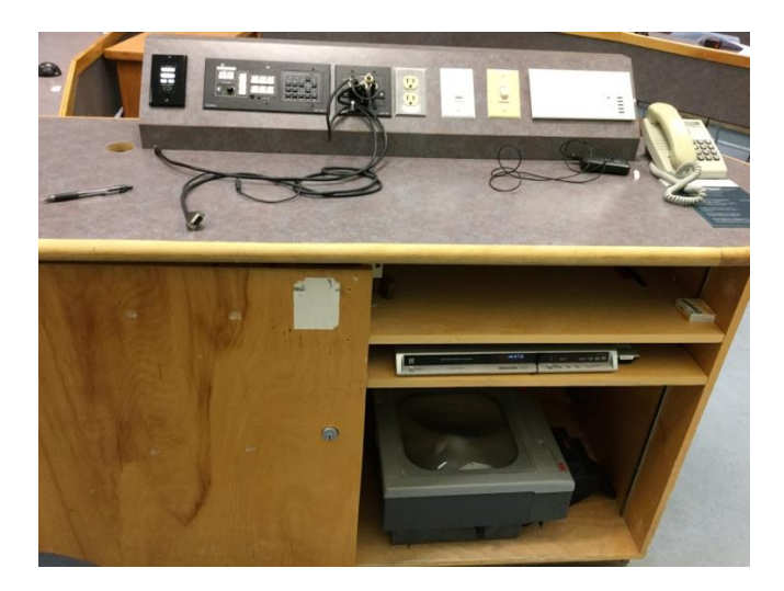
Image Description: Image of the podium at the front of the classroom. A phone is located on the right side of the podium. This podium is not movable or height adjustable. This podium is not accessible.

Image Description: The entryway of room 27 in Dunning Hall is a tan door with a silver doorknob on the left side.