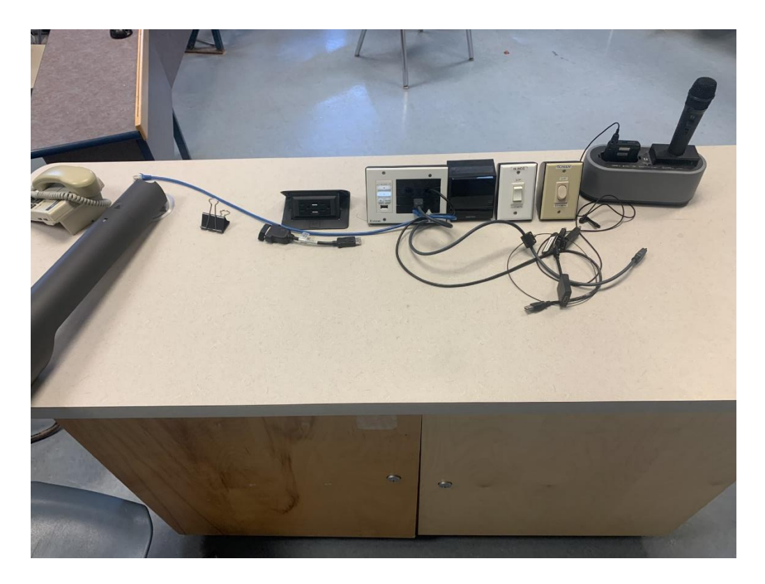
Image Description: The podium comes equipped with a phone, a document camera, a set of microphones as well as lecture capture.