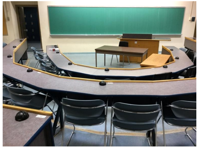
Image Description: View of the classroom from a student seat near the rear of the room. In front are four empty rows of tables and chairs. The instructor podium is at the front of the room in the middle. The front of the classroom has a long blackboard in the middle of the front wall. This classroom is accessible for students.

Image Description: The podium comes equipped with a phone, a document camera, a set of microphones as well as lecture capture.