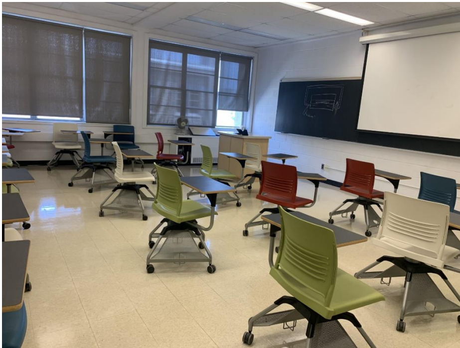
Image Description: The students view of the classroom. There are chalkboards across the front and side of the room and the instructors podium at the front left of the room.

Image Description: Podium is equipped with a set of connection cables in order to present media in the classroom.