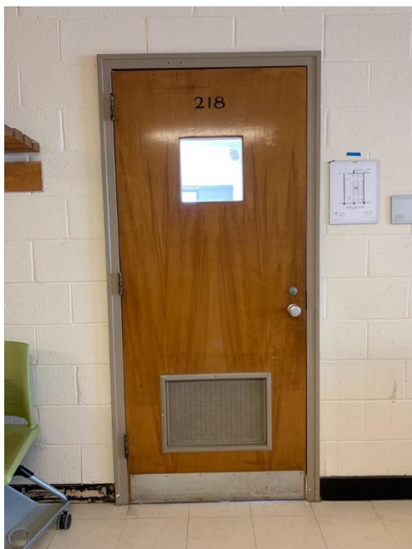
Image Description: Door for room 218 in Ellis Hall, the doorknob sits on the right side of the door.