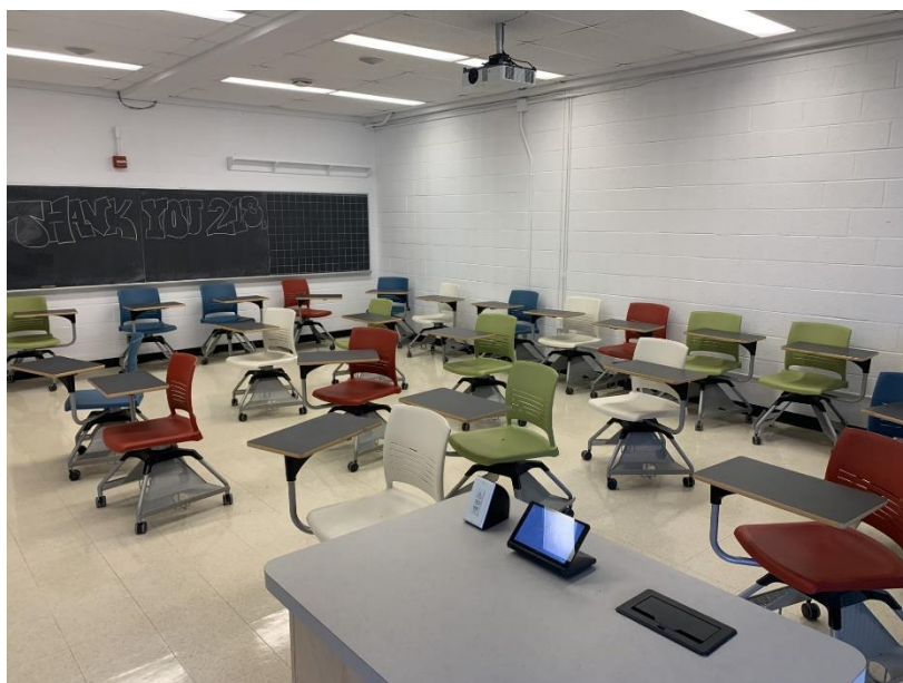
Image Description: The instructors view of the room. Along one of the side walls are three chalkboards and the seating in the room is flexible. Each student seat is equipped with a tablet arm.

For more information about accessibility on campus, please refer to the Accessibility Hub or the Facilities Building Directory