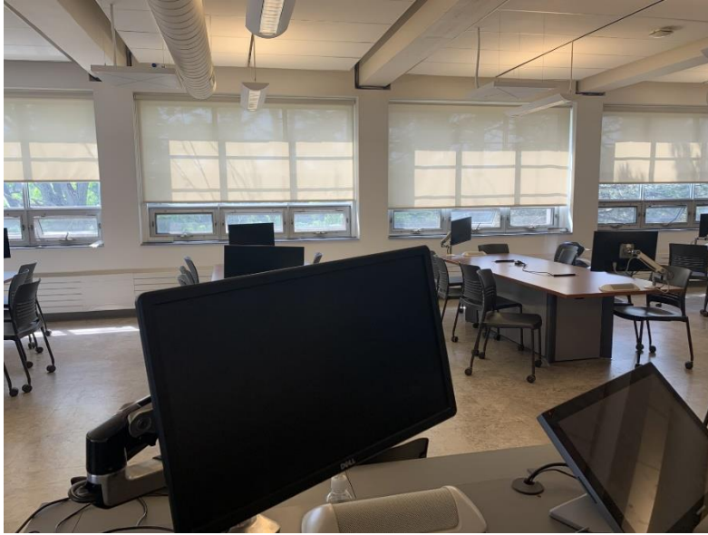
Image Description: Instructors view while in the classroom. The podium is at the center of the room and faces a wall of windows.