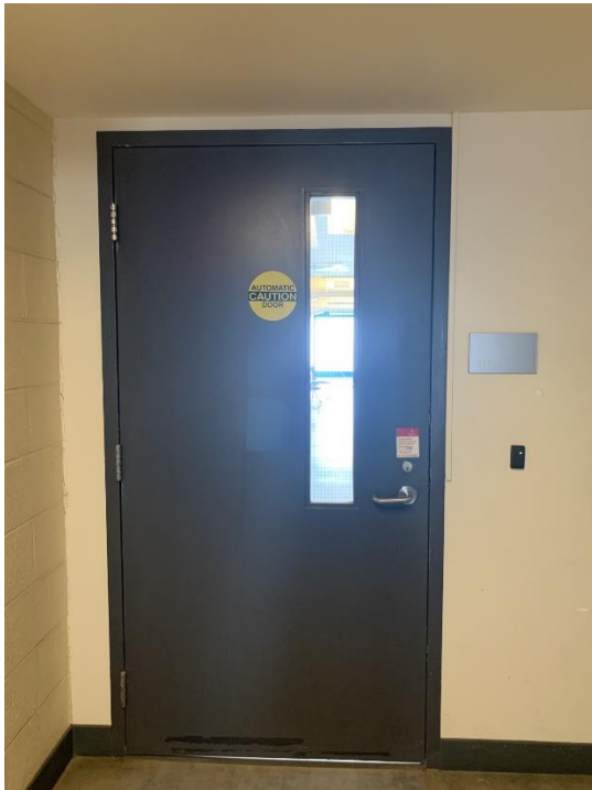
Image Description: The entrance to room 218 in Ellis Hall has a doorhandle on the right side of the door.

For more information about accessibility on campus, please refer to the Accessibility Hub or the Facilities Building Directory .