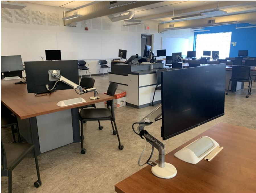
Image Description: The students view while sitting in the classroom. The room is set up with tables seating eight (8) students, with two monitors to present media at each table. The instructor's podium is at the center of the room. On three walls of the room here are whiteboards.

Image Description: Podium is equipped with a document camera, an outlet, lecture capture and a set of microphones. There is a computer from which media can be presented.