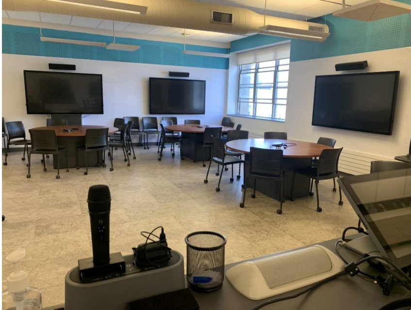
Image Description: Instructors view while in the room, there are circular tables with 6 chairs each. The chairs are rolling chairs. There are ten (10) screens throughout the room to present media.