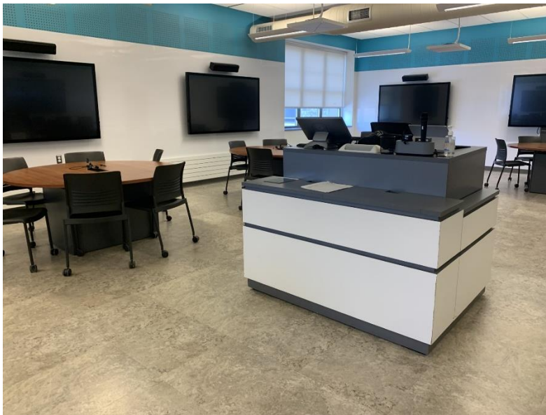
Image Description: Students view of the instructor's podium. The podium is height adjustable and accessible.

For more information about accessibility on campus, please refer to the Accessibility Hub or the Facilities Building Directory .