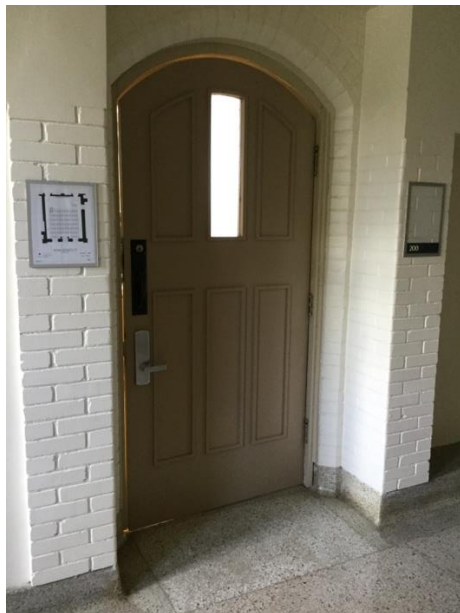
Image Description: The entryway of room 201 in Kingston Hall is a wooden door with a silver handle on the left side.