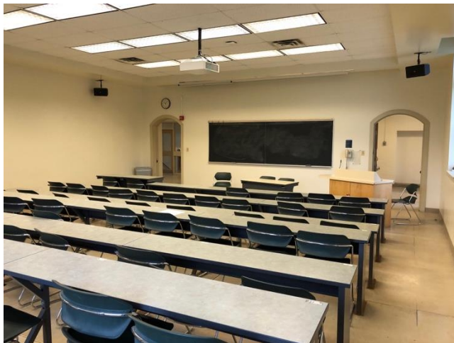
Image Description: View of the classroom from a student seat near the rear of the room. In front are multiple empty rows of tables and chairs. The instructor's podium is at the front of the room on the right. A long blackboard is located on the front wall. A projector on the ceiling projects onto a screen that extends from the ceiling. The entryway door is located at the front of the classroom, on the left. This classroom is accessible for students.

Image Description: View of the classroom from the instructor's podium. There are seven rows of long tables with chairs for students. This classroom is tiered, for access to the middle and back areas of the room. This classroom is accessible for instructors.