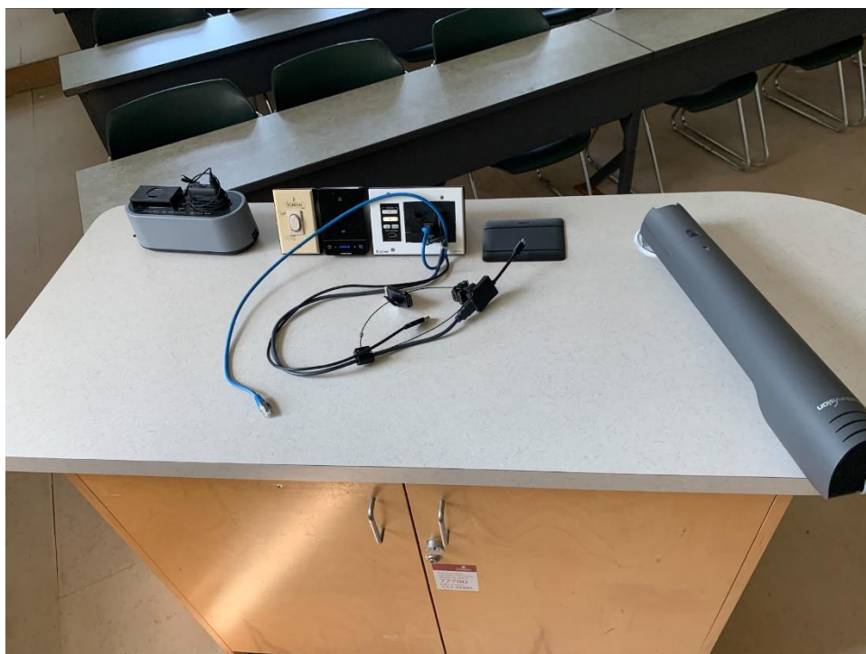
Image Description: Podium is equipped with a document camera, a set of microphones, connection cords to present media, lecture capture as well as lighting control for the room.

Image Description: The entryway of room 201 in Kingston Hall is a wooden door with a silver handle on the left side.