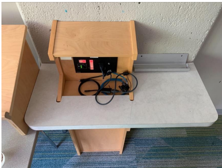
Image Description: Image of the wall podium at the front of the classroom. This podium is not movable or height adjustable. This podium is accessible.

Image Description: The entryway of room A309 in Mackintosh Corry Hall is a blue door with a doorknob on the right side.