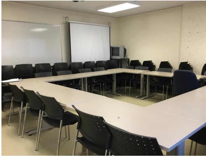
Image Description: View of the classroom from a student seat near the rear of the room. In front are multiple empty tables and chairs. A whiteboard is located on the front wall. A projector on the ceiling projects onto a screen that extends from the ceiling. This classroom is accessible for students.