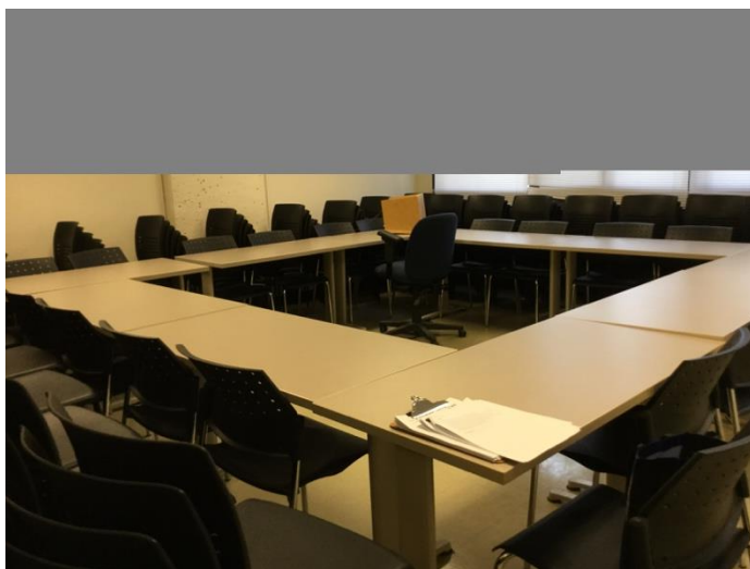
Image Description: View of the classroom from the front of the classroom. There are multiple tables and chairs for students, arranged in a rectangle in the middle of the room. This classroom is accessible for instructors.

Image Description: The entryway of room A416 in Mackintosh Corry Hall is a blue door with a doorknob on the left side.