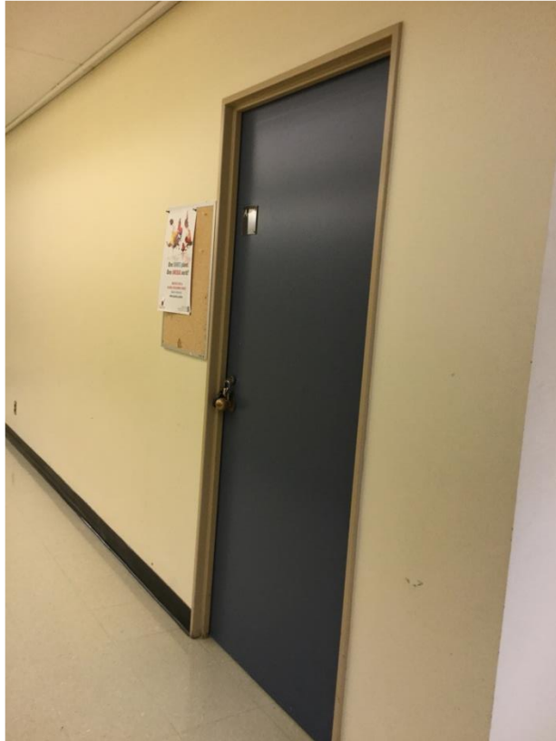
Image Description: The entryway of room A416 in Mackintosh Corry Hall is a blue door with a doorknob on the left side.