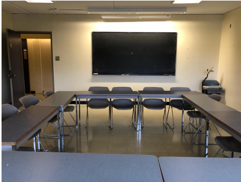
Image Description: View of the classroom from a student seat near the rear of the room. In front are multiple empty tables and chairs. A blackboard is located on the front wall. A projector on the ceiling projects onto a screen that extends from the ceiling. The entryway door is located at the front of the room on the left. This classroom is accessible for students.