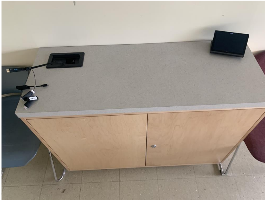
Image Description: Top-down view of the podium. The podium is equipped with a set of connection ports to present media in the classroom.

Image Description: View of the classroom from a student seat near the rear of the room. In front are multiple empty tables and chairs. A blackboard is located on the front wall. A projector on the ceiling projects onto a screen that extends from the ceiling. The entryway door is located at the front of the room on the left. This classroom is accessible for students.