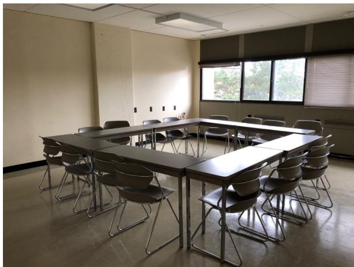
Image Description: View of the classroom from the front of the room. There are tables and chairs for students, arranged in a rectangle in the center of the room. This classroom is accessible for instructors.

Image Description: Image of the door to room 420 in Mackintosh Corry Hall. There is a doorknob on the left side of the door.