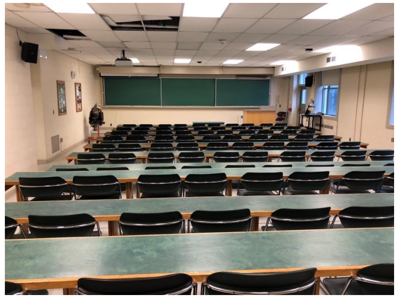
Image Description: View of the classroom from a student seat near the rear of the room. In front are three empty rows of tables and chairs. The instructor podium is at the front of the room on the right. The front of the classroom has a large blackboard in the middle of the front wall. A digital projector on the ceiling, projects onto a screen that extends from the ceiling. This classroom is accessible for students.