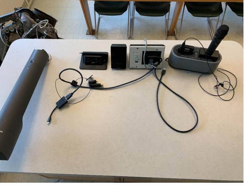
Image Description: On the podium there is a document camera, a set of microphones, a set of connection cords to present media and lecture capture.

For more information about accessibility on campus, please refer to the <u>Accessibility Hub</u> or the <u>Facilities Building Directory</u>.