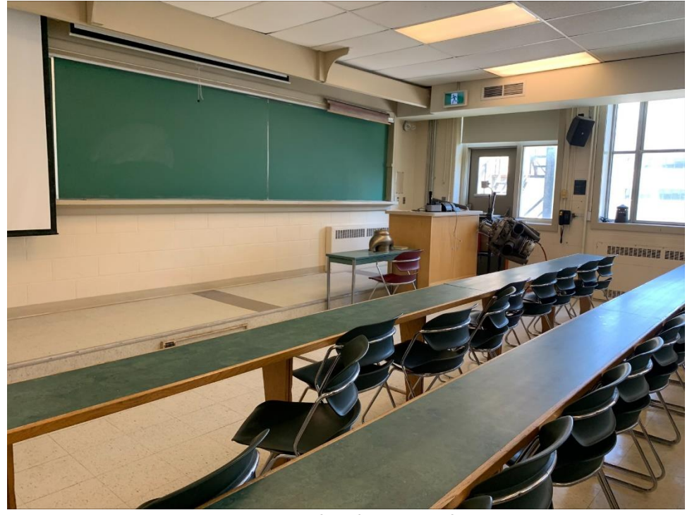
Image Description: Image shows the first few rows of the room as well as the instructor's podium. The podium is elevated and is not accessible by wheelchair. The front of the room has three (3) blackboards and a screen that can be raised or lowered for presenting via projector.

Image Description: View of the classroom from a student seat near the rear of the room. In front are three empty rows of tables and chairs. The instructor podium is at the front of the room on the right. The front of the classroom has a large blackboard in the middle of the front wall. A digital projector on the ceiling, projects onto a screen that extends from the ceiling. This classroom is accessible for students.