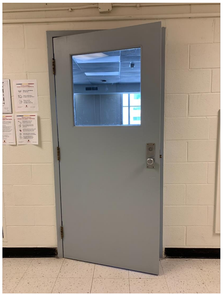
Image Description: Door to room 315 in McLaughlin Hall. The entryway has no ledge while entering the room and have a round turning handle to open the door.