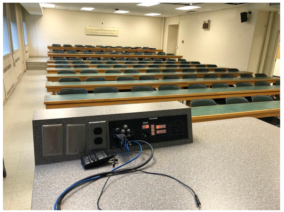
Image Description: View of the classroom from the instructor's podium. There are 12 long tables with chairs for students. The entryway door is located at back of the classroom, on the right. This classroom is not accessible for instructors.