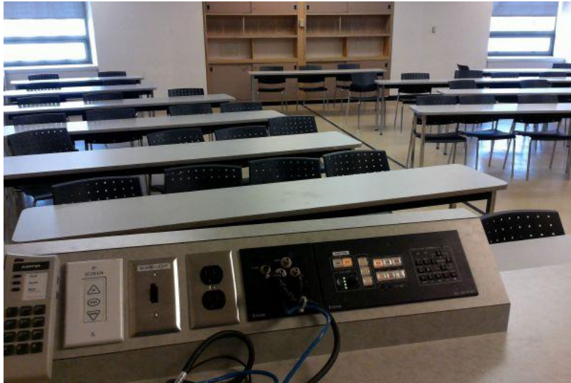
Image Description: View of the classroom from the instructor's podium. There are six rows of long tables and chairs for students. This classroom is not accessible for instructors.