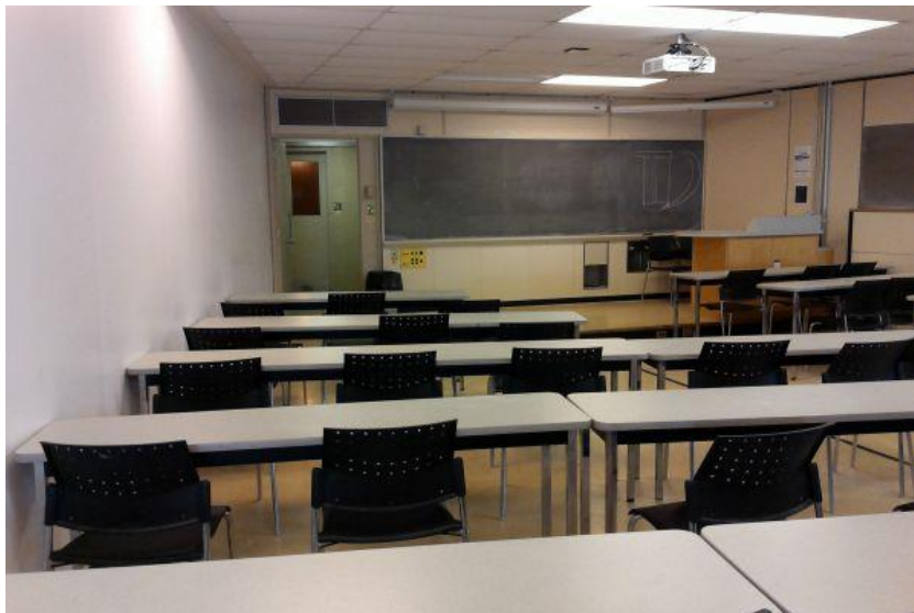
Image Description: View of the classroom from a student seat near the rear of the room. In front are multiple rows of empty tables and chairs. The instructor podium is located at the front of the room on the right. The front of the classroom has a long blackboard in the middle of the front wall. A digital projector on the ceiling, projects onto a screen that extends from the ceiling. The entryway door is located at the front of the room, on the left. This classroom is accessible for students.

Image Description: View of the classroom from the instructor's podium. There are six rows of long tables and chairs for students. This classroom is not accessible for instructors.