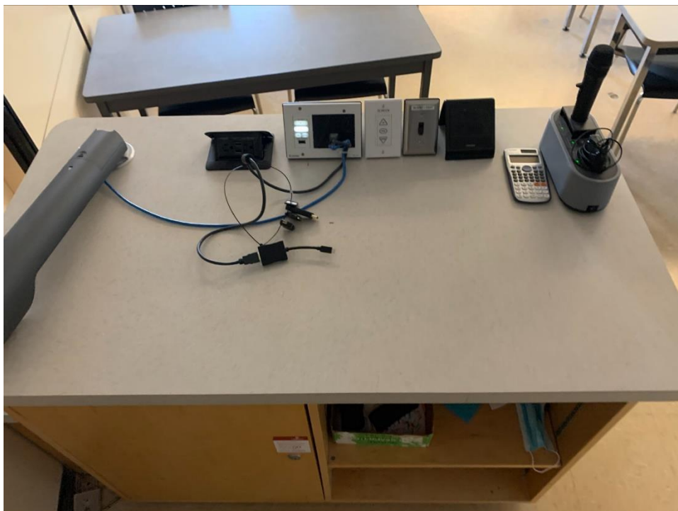
Image Description: The podium is equipped with a document camera, lecture capture, a set of microphones and connection cords to project media.

For more information about accessibility on campus, please refer to the Accessibility Hub or the Facilities Building Directory .