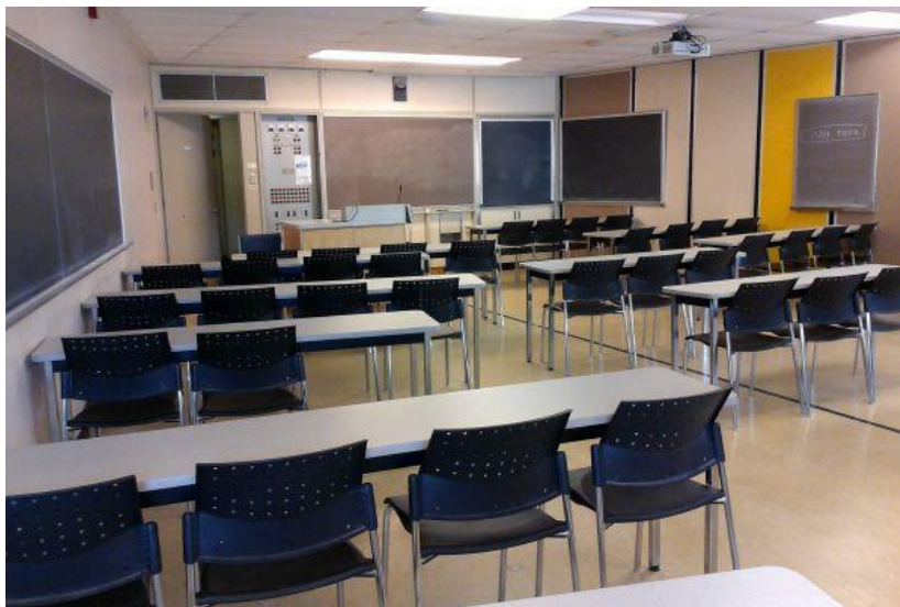
Image Description: View of the classroom from a student seat near the rear of the room. In front are multiple rows of empty tables and chairs. The instructor podium is at the front of the room on the left. The classroom has a blackboard in the middle of the front wall. A digital projector on the ceiling, projects onto a screen that extends from the ceiling. The entryway door is located at the front of the room, on the left. This classroom is accessible for students.

Image Description: View of the classroom from the instructor's podium. There are six rows of long table and chairs for students. This classroom is accessible for instructors.