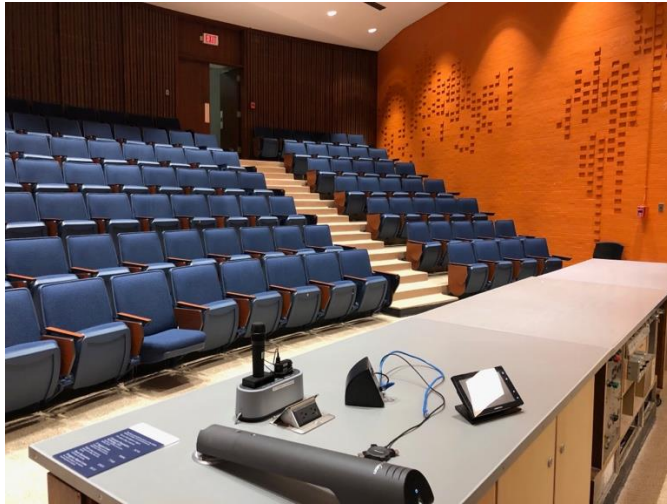
Image Description: View of the classroom from the instructor's podium. There are multiple rows of chairs for students, with tiered steps to access tables in the middle and back area of the classroom. This classroom is not accessible for instructors.