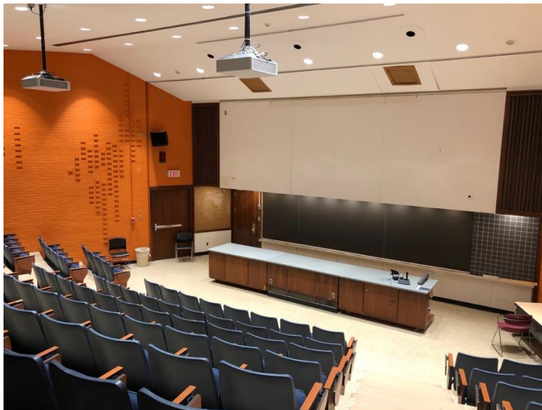
Image Description: View of the classroom from a student seat near the rear of the room. In front are multiple rows of empty chairs. The instructor podium is at the front of the room, in the middle. The classroom has a long blackboard in the middle of the front wall. A digital projector on the ceiling, projects onto a screen that extends from the ceiling. The entryway door is located at the front of the room, on the left. This classroom is not accessible for students.

Image Description: View of the classroom from the instructor's podium. There are multiple rows of chairs for students, with tiered steps to access tables in the middle and back area of the classroom. This classroom is not accessible for instructors.