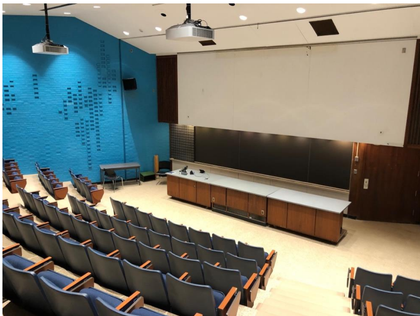
Image Description: View of the classroom from a student seat near the rear of the room. In front are multiple empty rows of chairs. The instructor podium is at the front of the room, in the middle. The classroom has a long blackboard in the middle of the front wall. Two digital projectors on the ceiling, project onto a screen that extends from the ceiling. This classroom is not accessible for students.