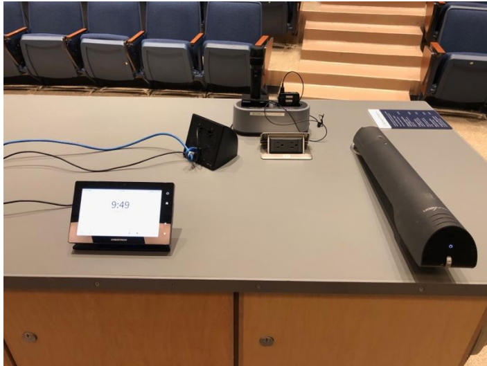
Image Description: Image of the podium at the front of the classroom. This podium is not movable or height adjustable. This podium is not accessible.