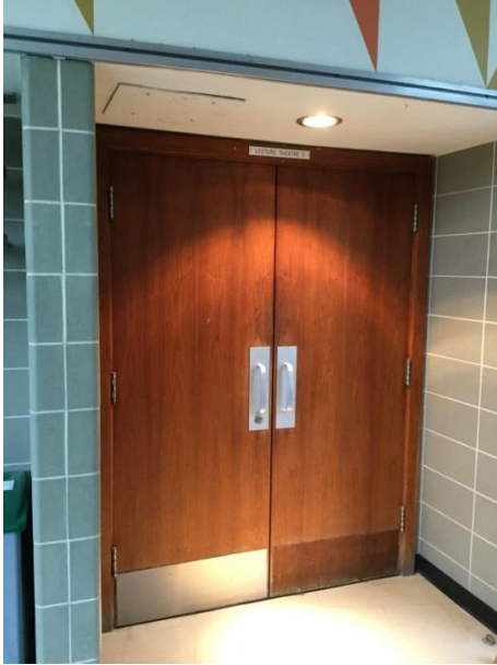
Image Description: The entryway of the classroom C in Stirling Hall is a wooden double door with silver handles in the middle.