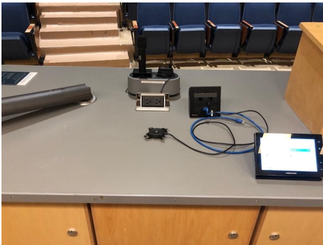
Image Description: Image of the podium at the front of the classroom. This podium is not movable or height adjustable. This podium is not accessible.

Image Description: The entryway of the classroom C in Stirling Hall is a wooden double door with silver handles in the middle.