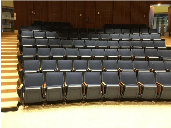
Image Description: View of the classroom from the instructor's podium. There are six rows of chairs for students, with tiered steps to access tables in the middle and back area of the classroom. The entryway door is located at the back of the room, on the right. This classroom is not accessible for instructors.