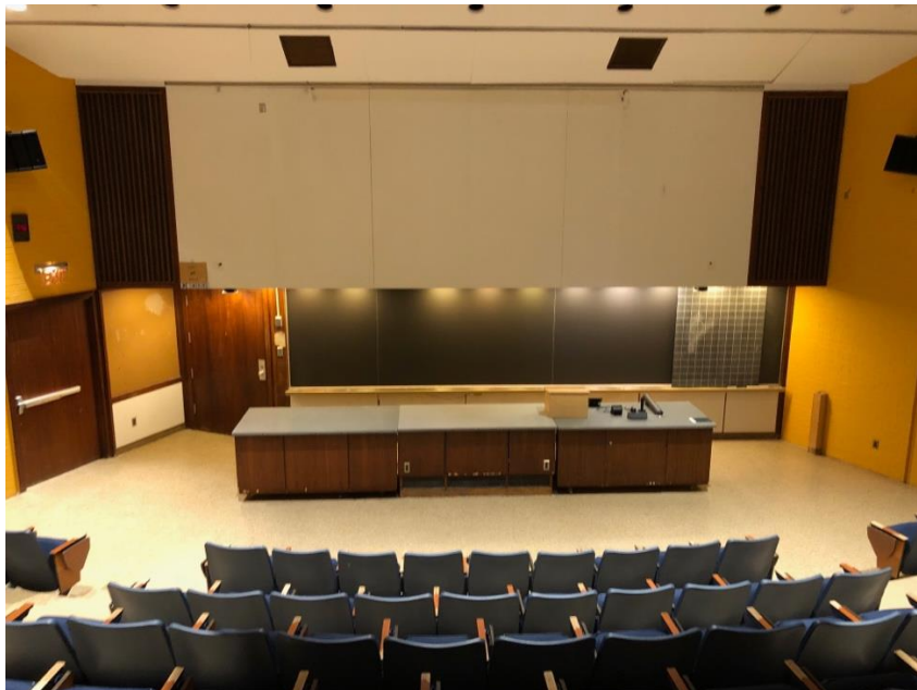
Image Description: View of the classroom from a student seat near the rear of the room. In front are multiple rows of empty chairs. The instructor podium is at the front of the room, in the middle. The classroom has a long blackboard in the middle of the front wall. A digital projector on the ceiling, projects onto a screen that extends from the ceiling. This classroom is not accessible for students.

Image Description: View of the classroom from the instructor's podium. There are six rows of chairs for students, with tiered steps to access tables in the middle and back area of the classroom. The entryway door is located at the back of the room, on the right. This classroom is not accessible for instructors.